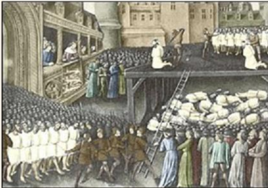
Richard watches the massacre From a 15th century illustration

Meanwhile in England Richard's brother John had been plotting with Philip to divide Richard's realm. John wanted the emperor to keep Richard prisoner, but Hubert Walter raised the money for his ransom and Richard was set free early in 1194. Richard hurried to England but stayed only long enough to raise more money for a new campaign in France.