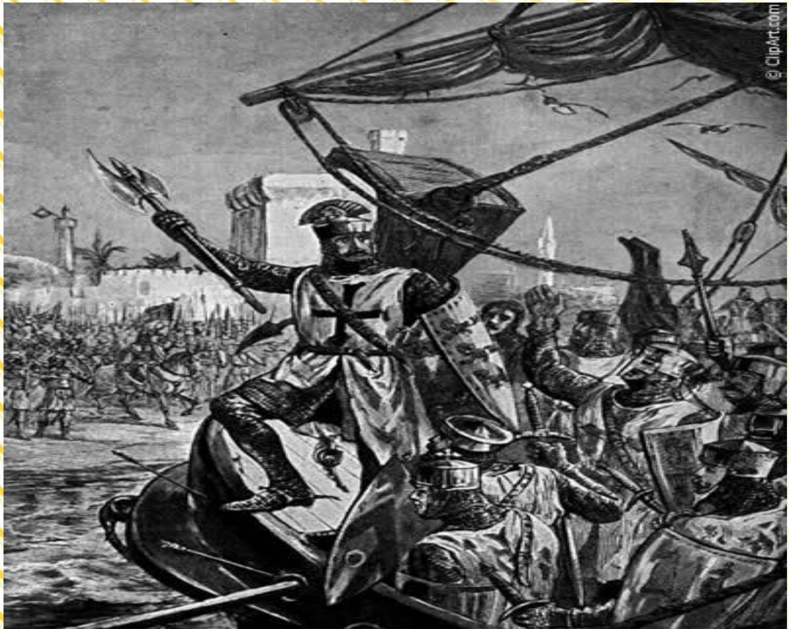
Richard the Lionheart Makes a Sea Landing