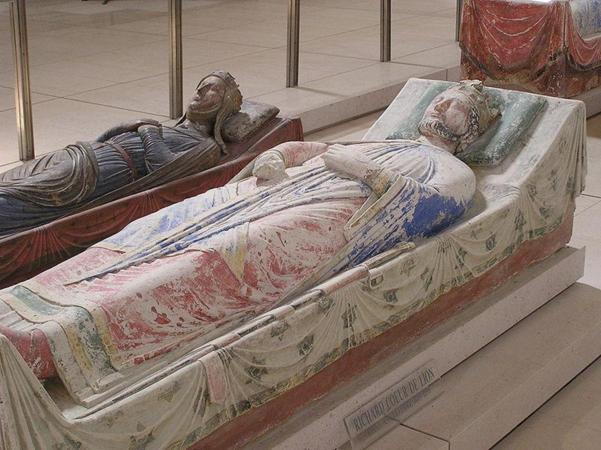
RICHARD COEUR DE LION