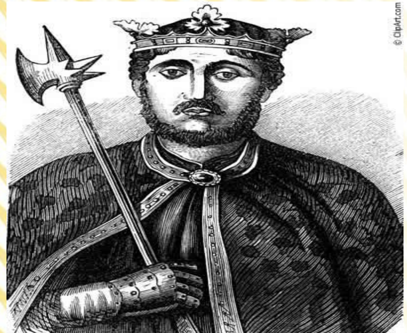
Richard the Lionheart