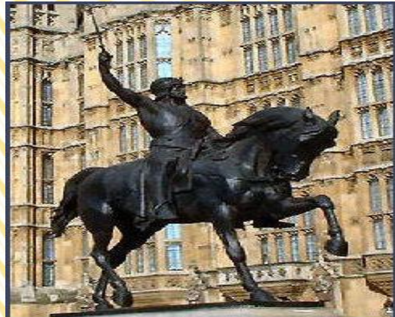
Statue of Richard the Lionheart outside the Houses of Parliament