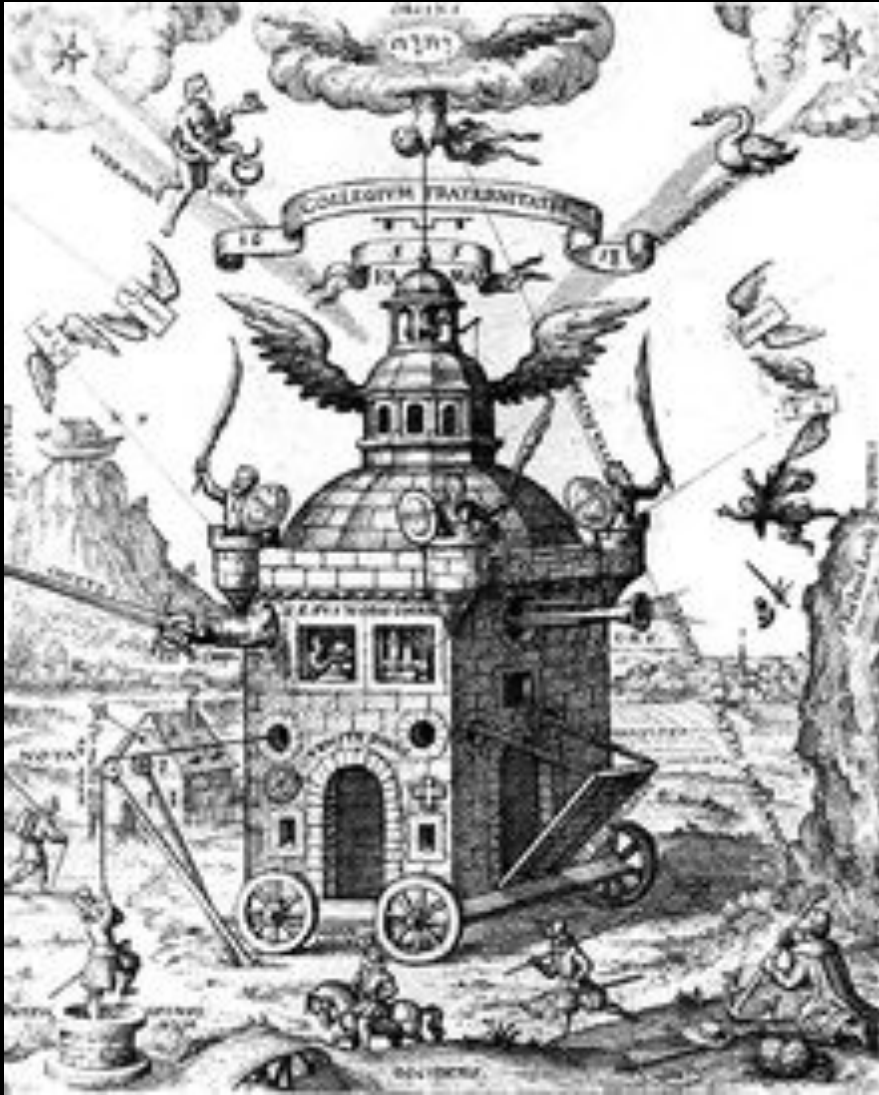
Emblematic image of a Invisible College

Returned to England from continental Europe in mid-1644 with a keen interest in scientific research.