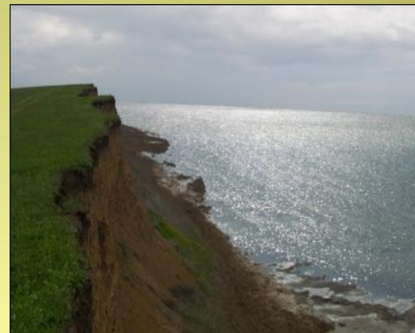
Manych Gudilo Lake