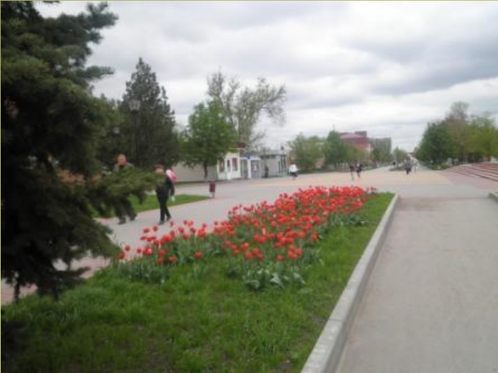
The central alley