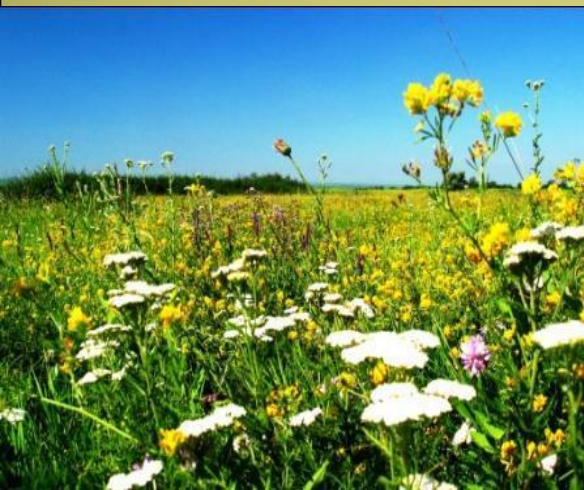
The steppes of the Reserve