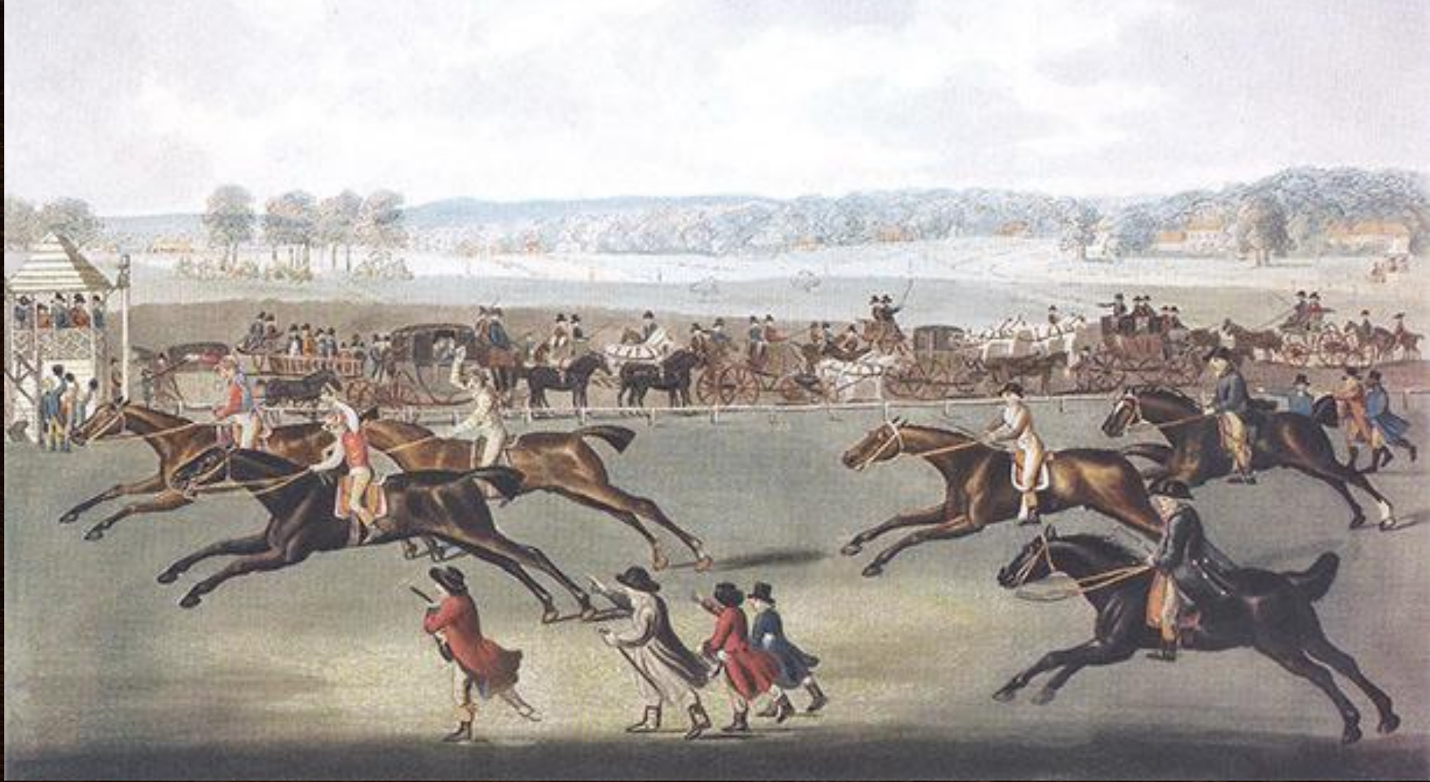
A contemporary illustration by John Nost Sartorius (1759-1828) of the Oatlands Sweepstake, run at Ascot on June 28th, 1751