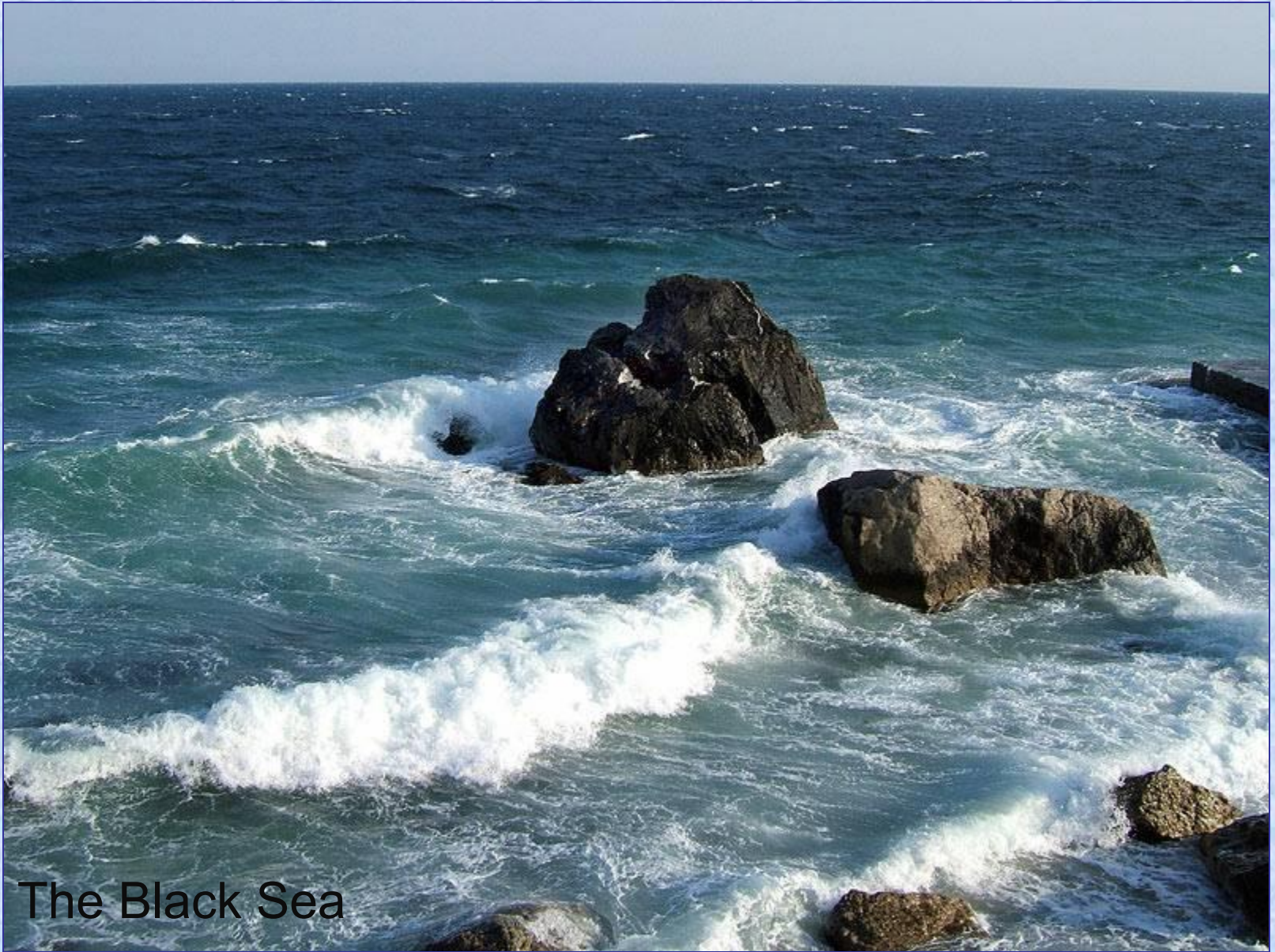
The Black Sea