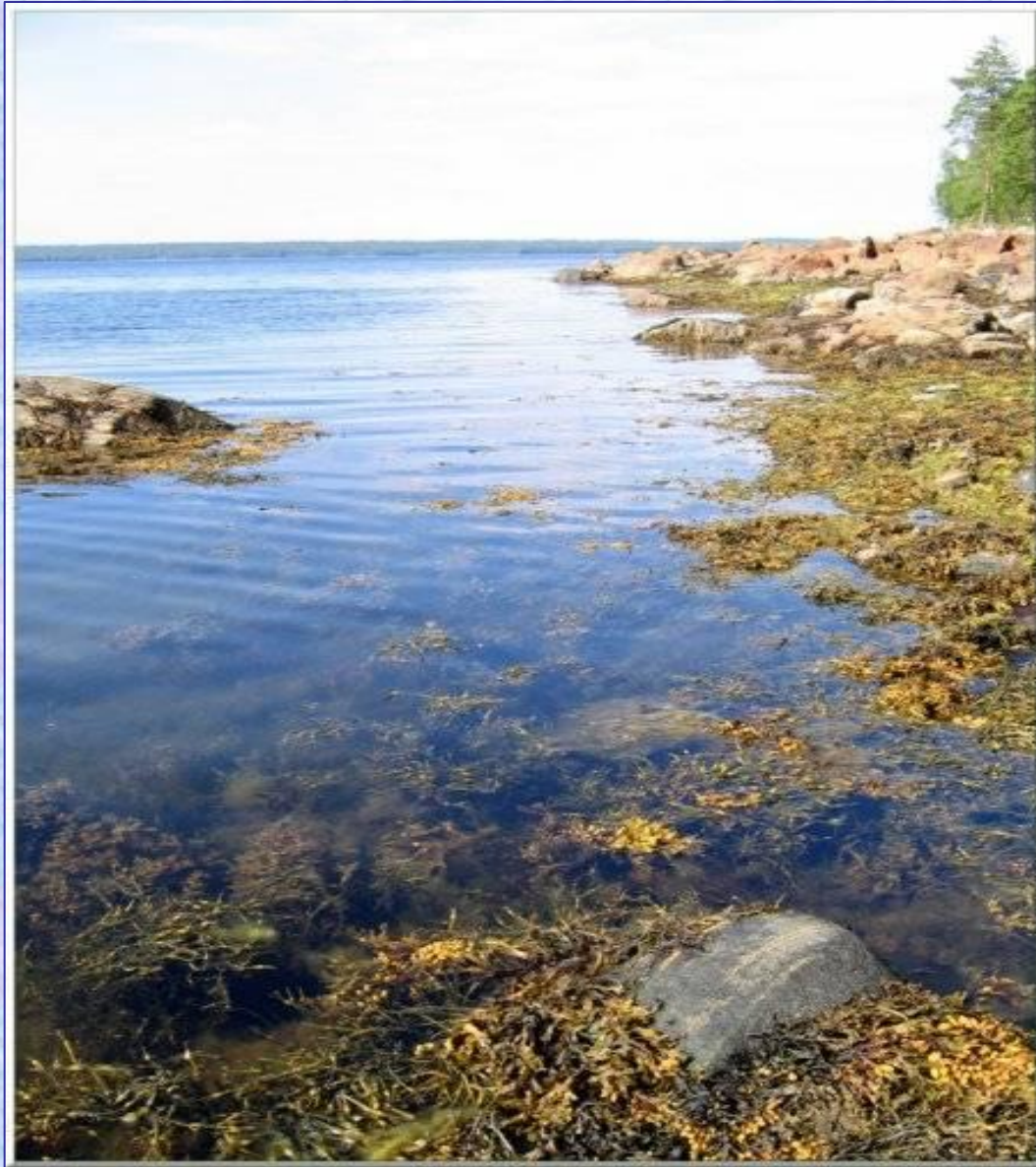
The White Sea