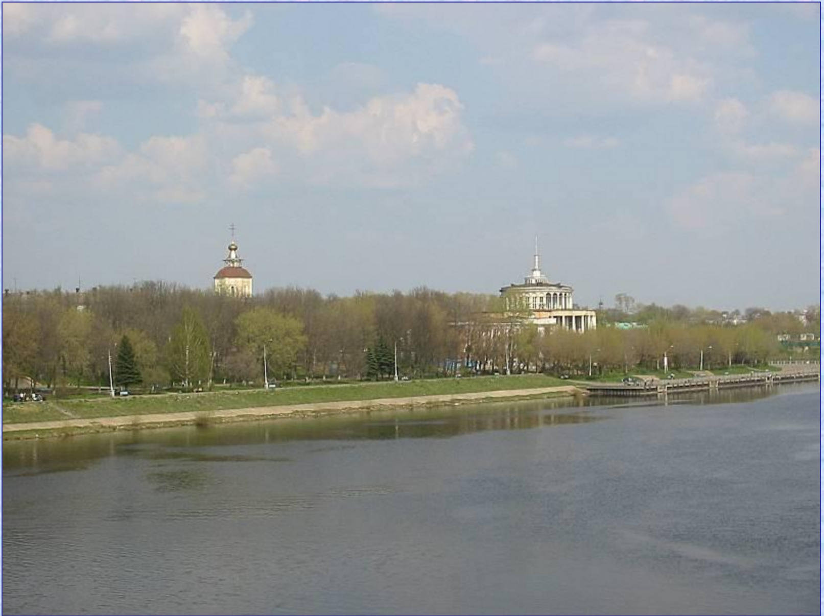
The Volga river