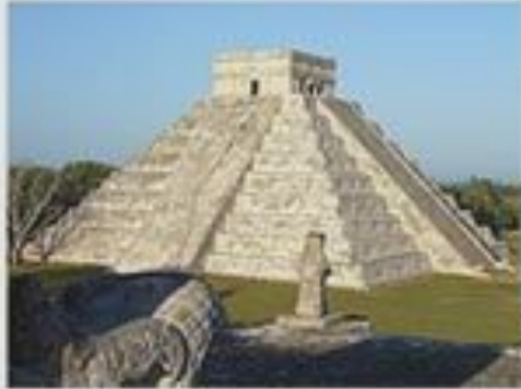
Chichén Itzá, Mexico

The New7Wonders organization is happy to announce the following 7 candidates have been elected to represent global heritage throughout history.