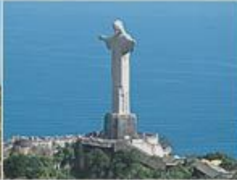
Christ Redeemer, Brazil