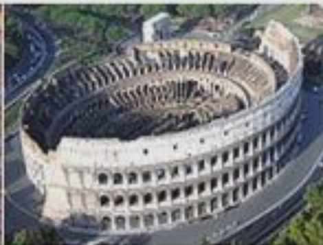
The Roman Colosseum, Italy