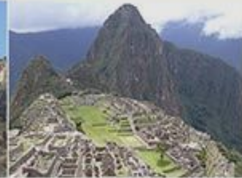
Machu Picchu, Peru