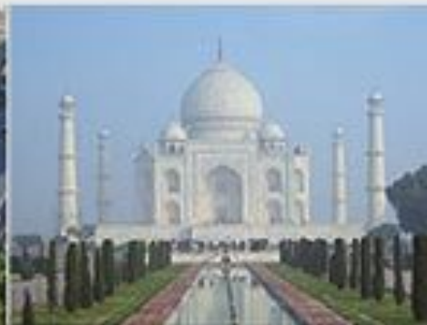
The Taj Mahal, India

As a response to Europe's "Seven Wonders of the World" list, which didn't include any Russian sights, Russia organized a national contest to select the seven most beautiful destinations the country has to offer.