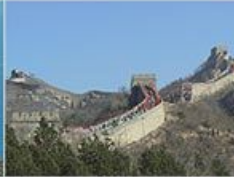
The Great Wall, China