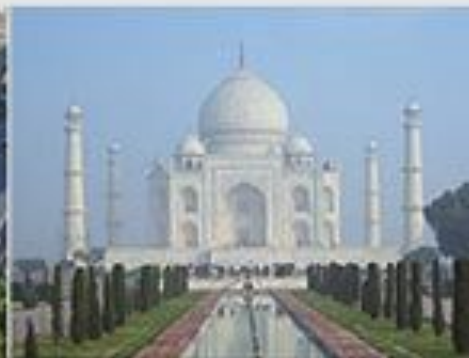
The Taj Mahal, India

As a response to Europe's "Seven Wonders of the World" list, which didn't include any Russian sights, Russia organized a national contest to select the seven most beautiful destinations the country has to offer.