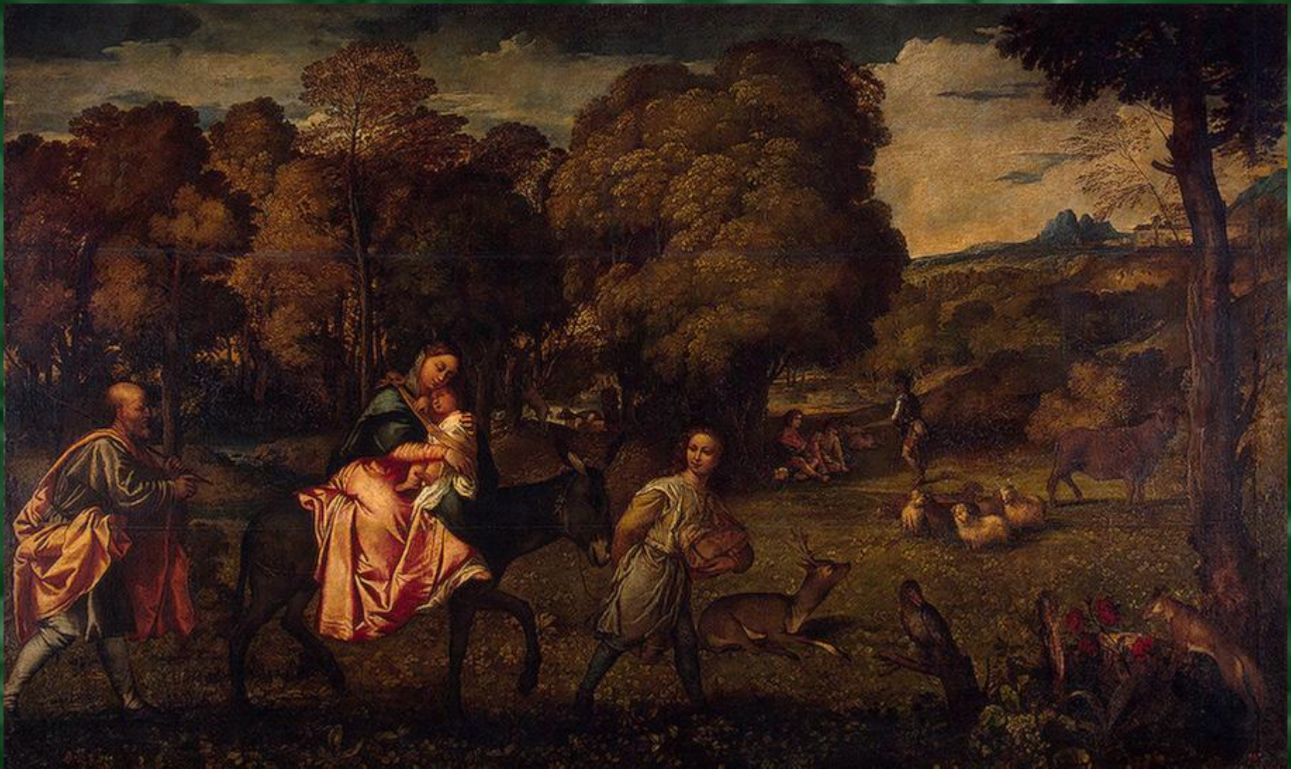
Titian "Escape to Egypt" 1508