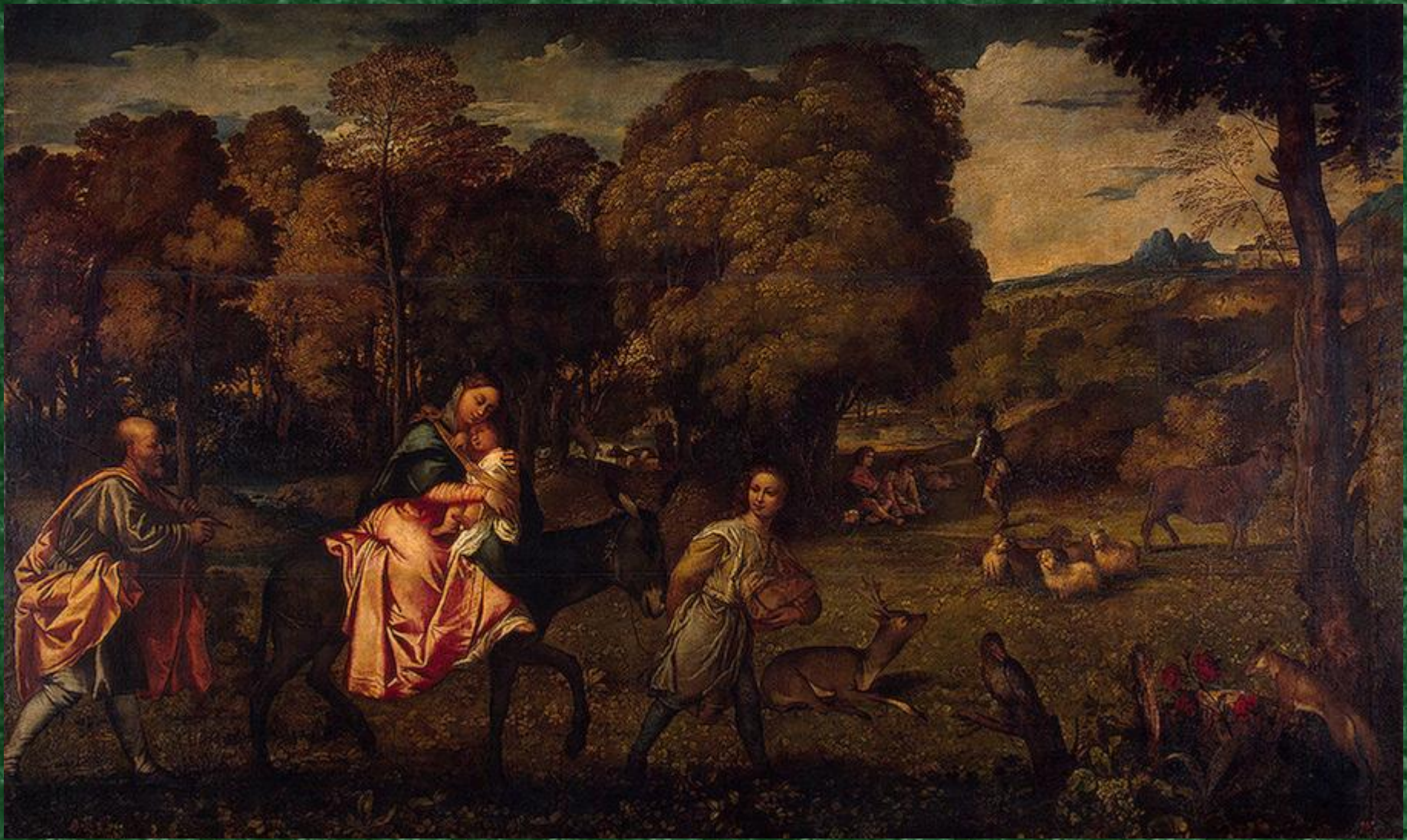
Titian "Escape to Egypt" 1508