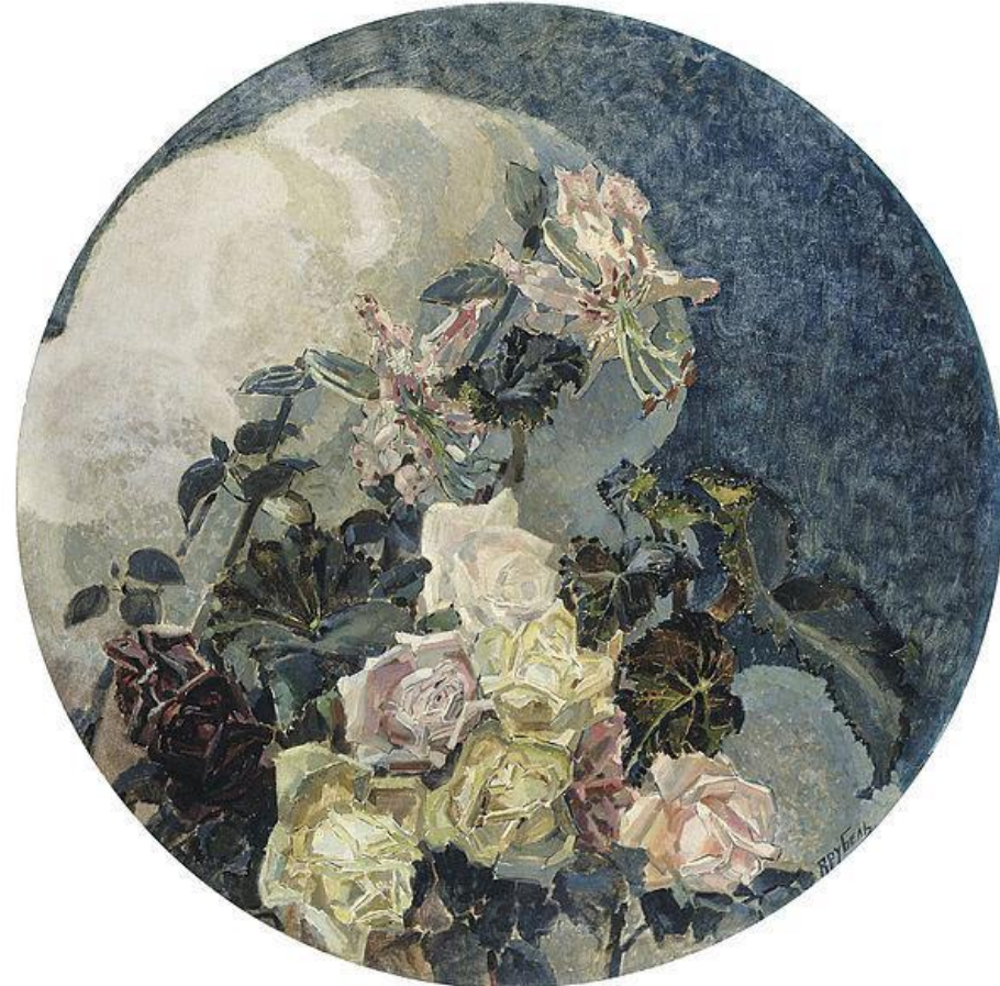
“Roses and Orchids” 1894. Oil on canvas