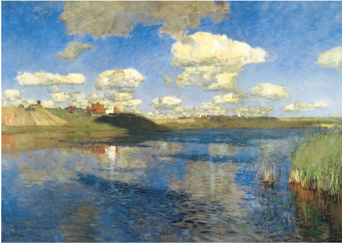
"Lake" 1900. Oil on canvas

"Lake" is Levitan's last painting, an unfinished masterpiece by the Russian painter (born in Kaunas, Lithuania) who mastered the landscape of mood , a very emotional interpretation of the Russian landscape. While Levitan, as many other Russian landscape painters, was clearly influenced by the Barbizon School, this late work is (un)finished in a somewhat impressionist way.