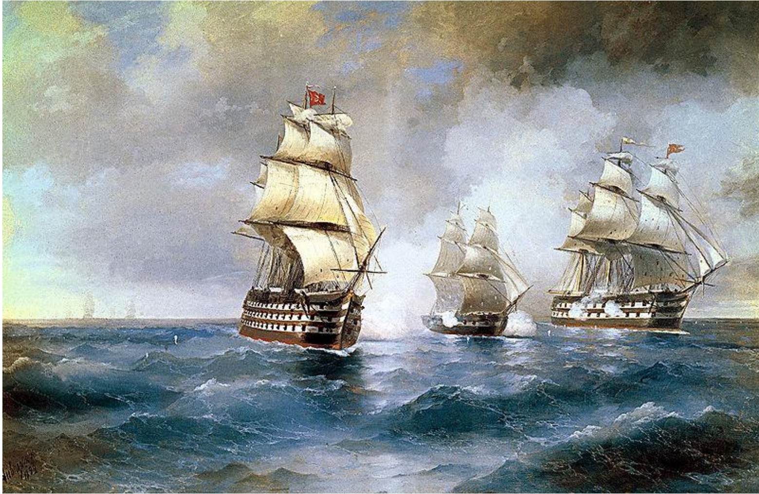
Brig "Mercury" Attacked by Two Turkish Ships 1892. Oil on canvas. The Tretyakov Gallery, Moscow, Russia