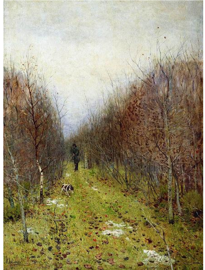
“Autumn Landscape” 1880