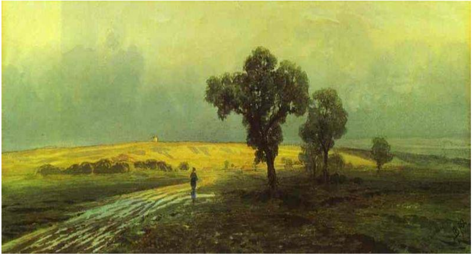
“After a Heavy Rain” 1870