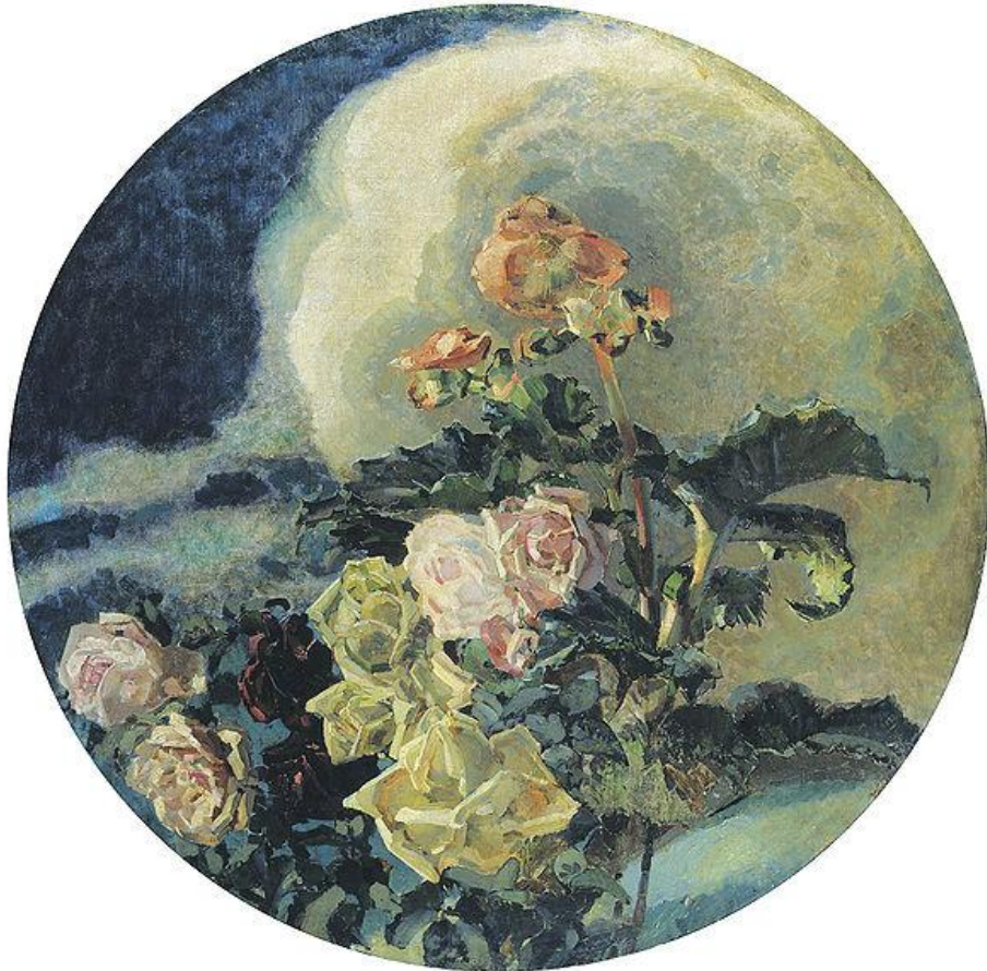
“Yellow Roses” 1894. Oil on canvas