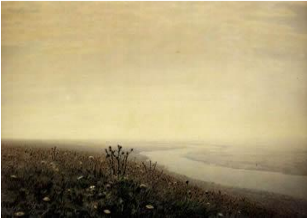
"Dnepr in the morning" 1881. Oil on canvas. The Tretyakov Gallery, Moscow, Russia

"Dnepr in the morning" (as "Dnepr in the night", executed a year before) is considered as one of the first works finished with Kuindzhi's "mature" style, with stunning light and atmospheric effects. This panoramic view is especially remarkable for its simple but very strong composition.