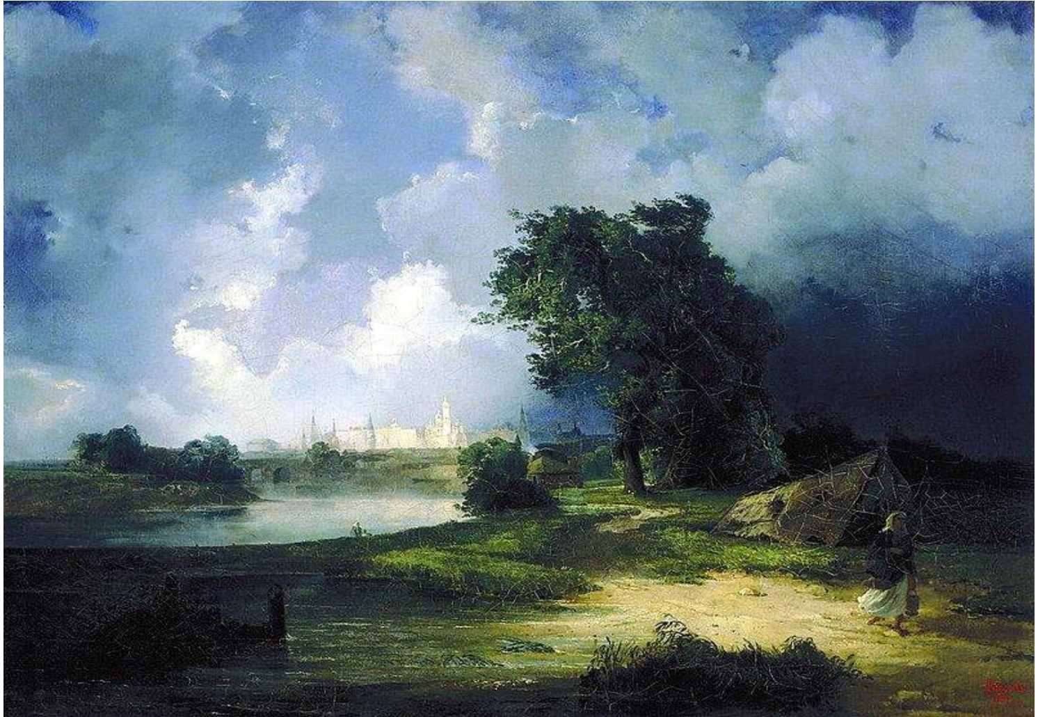
“View of the Kremlin from the Krymsky Bridge in Inclement Weather” 1851