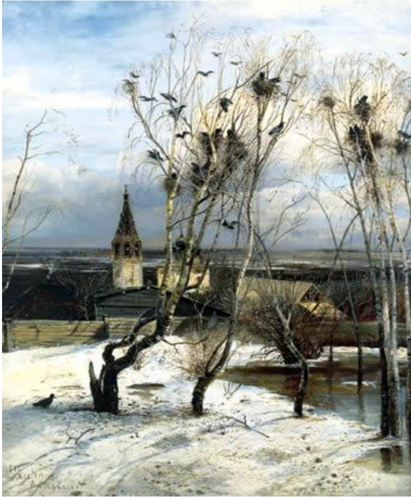
“The rooks have returned” 1871. Oil on canvas. Tetryakov Gallery, Russia

Savrasov was one of the most important -arguably the most important- of all the 19th century Russian landscape painters, considered the creator of the "lyrical landscape style". A truly emblematic work, "the rooks have returned" (or "the rooks have come back") is Savrasov's most famous painting, a lovely elegy to the spring announced by the rooks return. The canvas shows Savrasov's love for the rural Russian landscape, very influenced by John Constable.