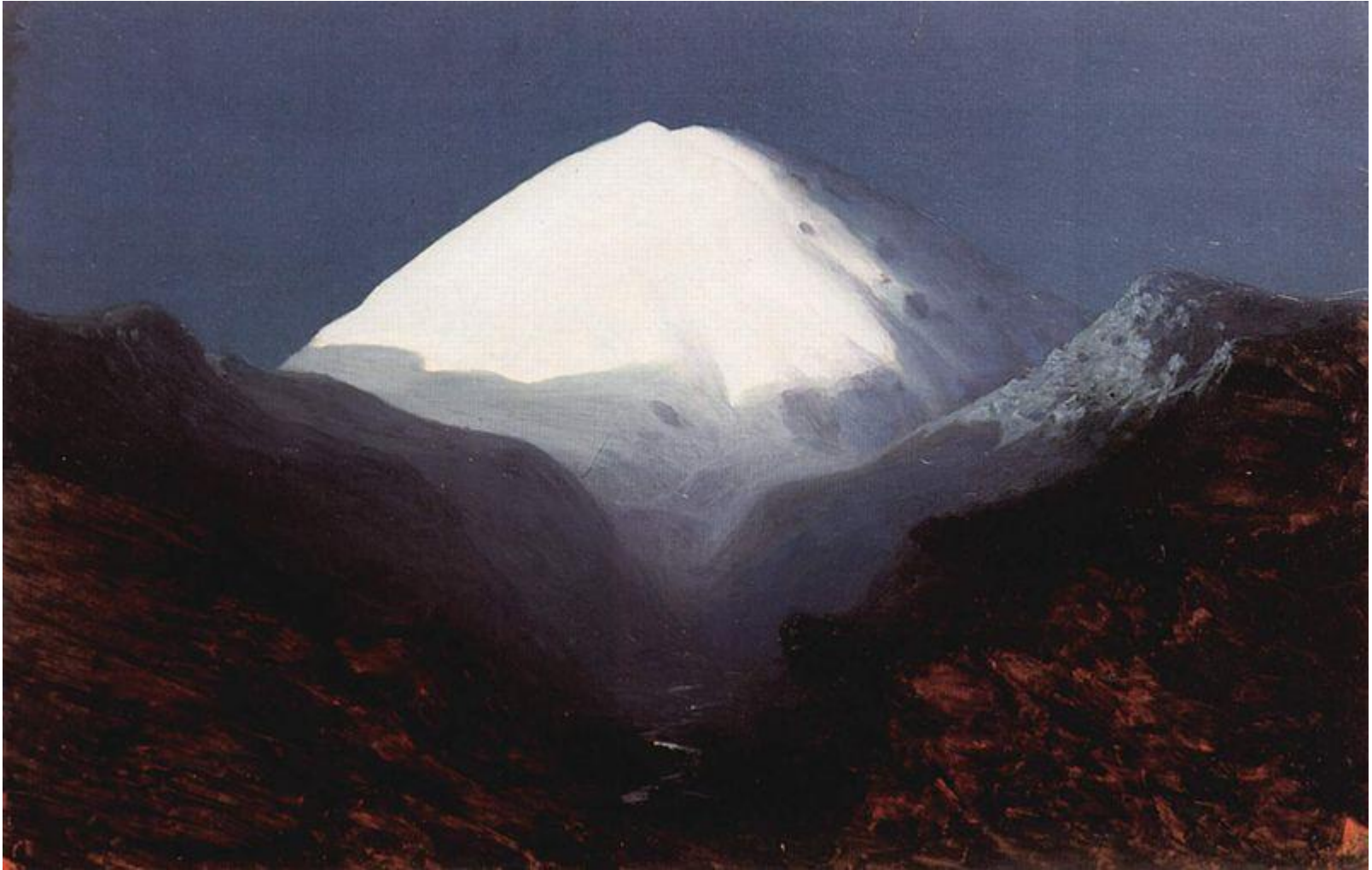
"Mount Elbrus, moonlit night"

1890-1895. Oil on paper mounted on canvas. Tretyakov Gallery, Moscow