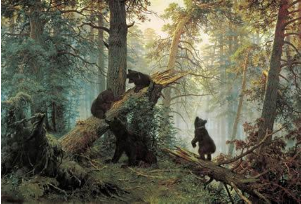
"Morning in a pine forest" 1886. Oil on canvas. Tetryakov Gallery, Russia

"Morning in a pine forest" is a marvelous pictorial fantasy that goes beyond the pure realism developed by many other Russian painters of the era. Shishkin has chosen one of his favorite motifs, the dense Russian pine forest, adding the unusual and rather bucolic presence of a family of bears.