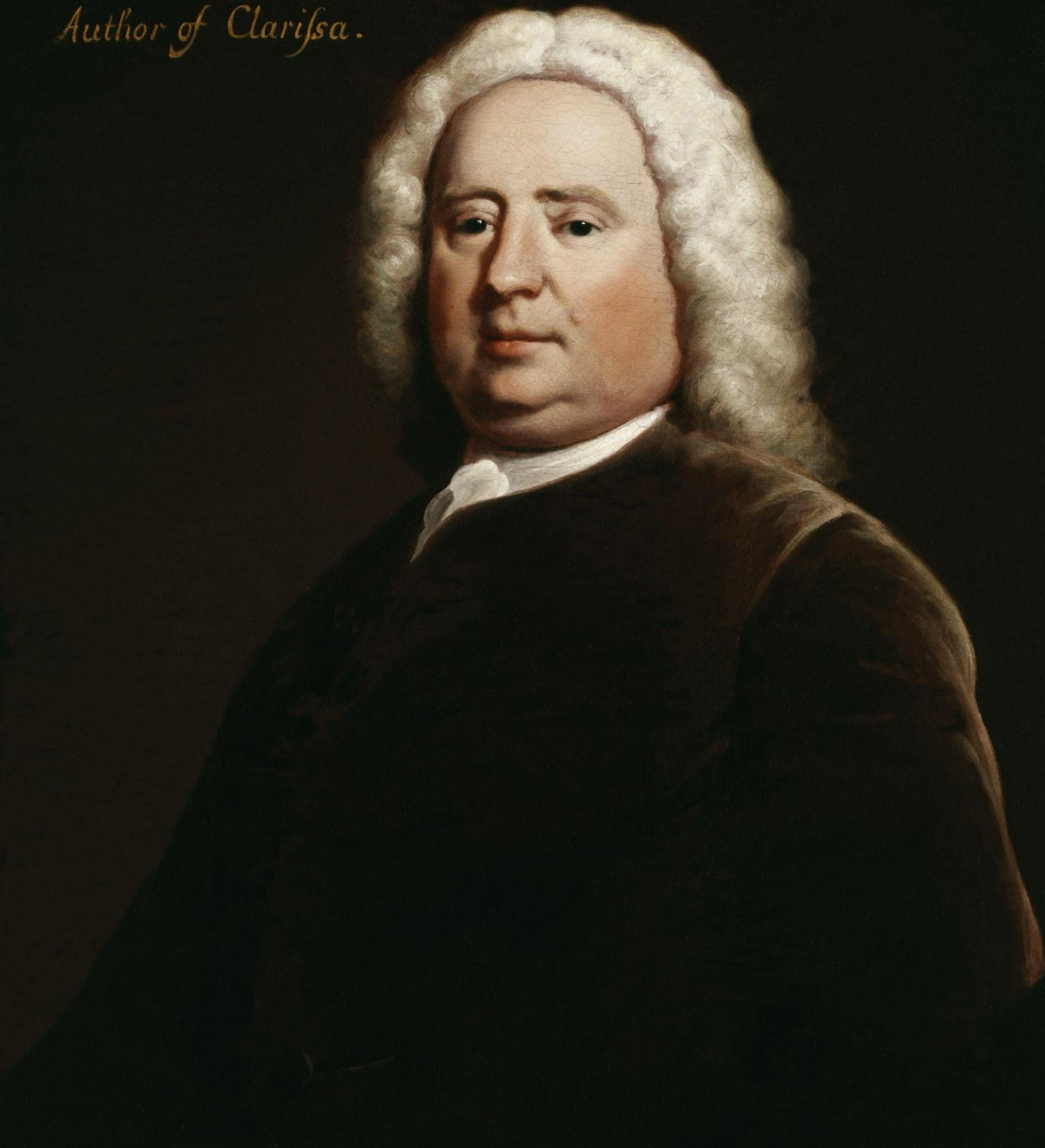
S. Richardson Author of Clarissa.