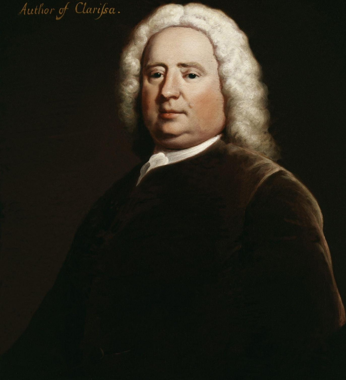
S. Richardson Author of Clarissa.