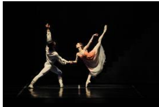
Romeo and Juliet