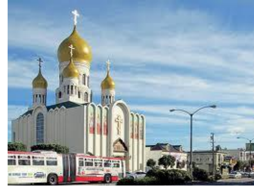
Holy Virgin Cathedral