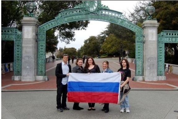
Russian Club UC Berkeley