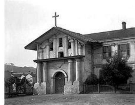
Saint Francis Mission