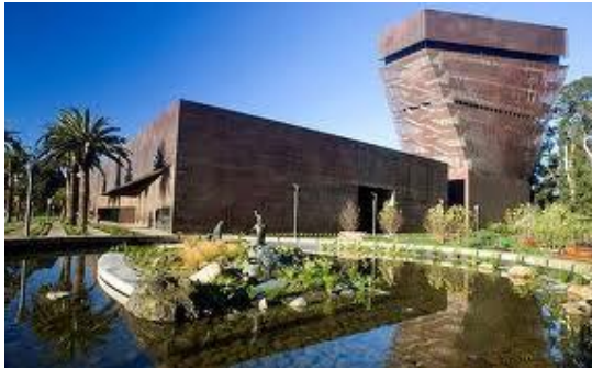
De Young Museum