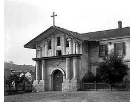
Saint Francis Mission