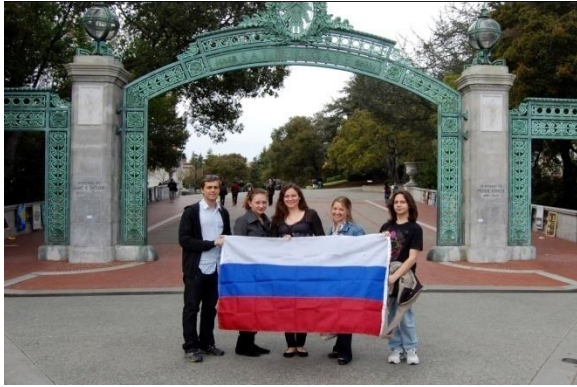
Russian Club UC Berkeley