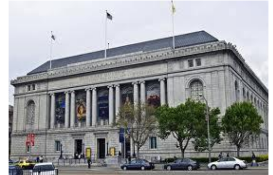
Asian Art Museum