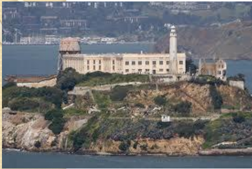
Alcatraz- a former prison