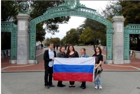
Russian Club UC Berkeley