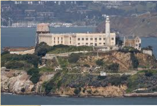
Alcatraz- a former prison