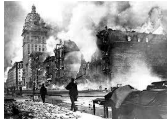
Great Earthquake and Fire of 1906