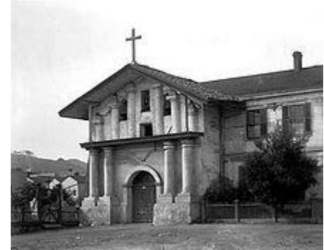
Saint Francis Mission