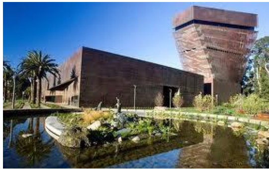
De Young Museum