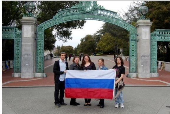
Russian Club UC Berkeley