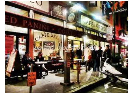
Café Greco North Beach