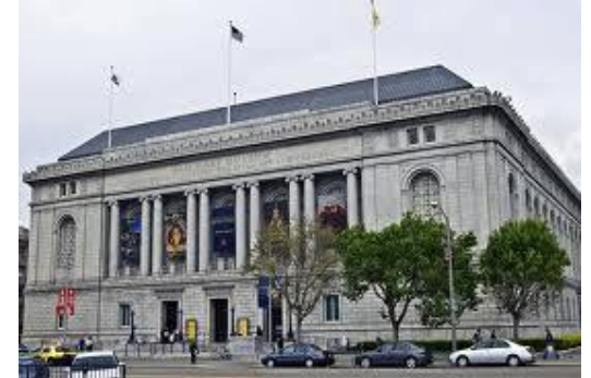
Asian Art Museum