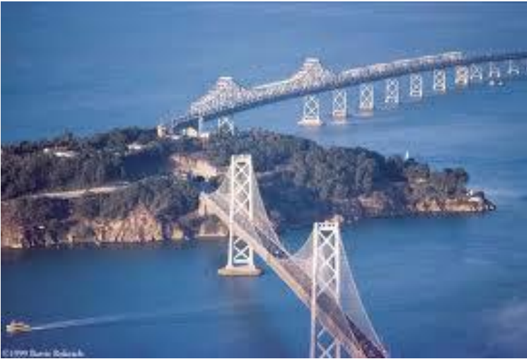
The San Francisco-Oakland Bay Bridge