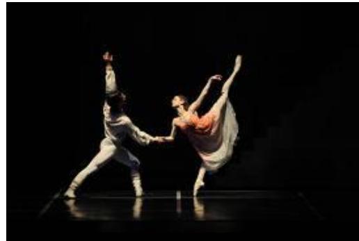
Romeo and Juliet