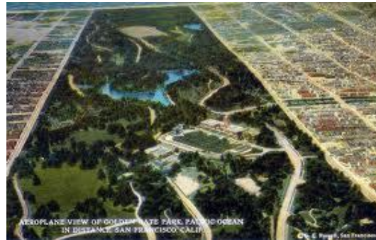
Golden Gate Park