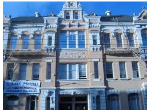
Russian Cultural Center