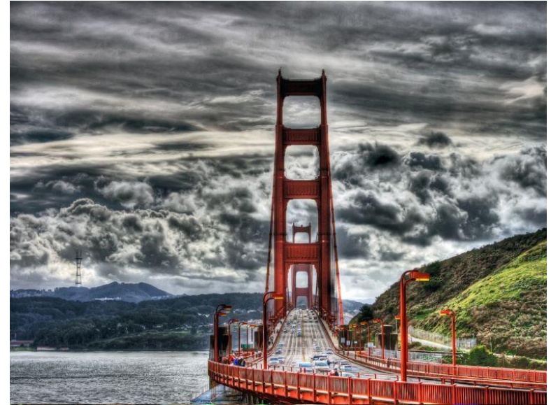
The Golden Gate Bridge