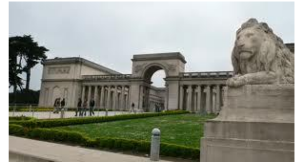
Legion of Honor Museum