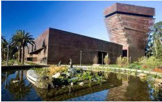
De Young Museum