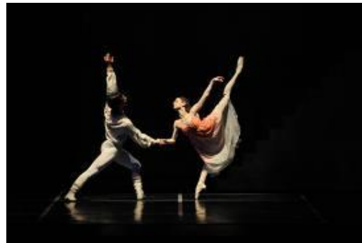
Romeo and Juliet