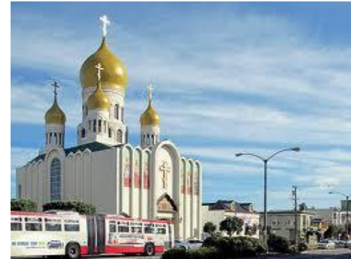
Holy Virgin Cathedral