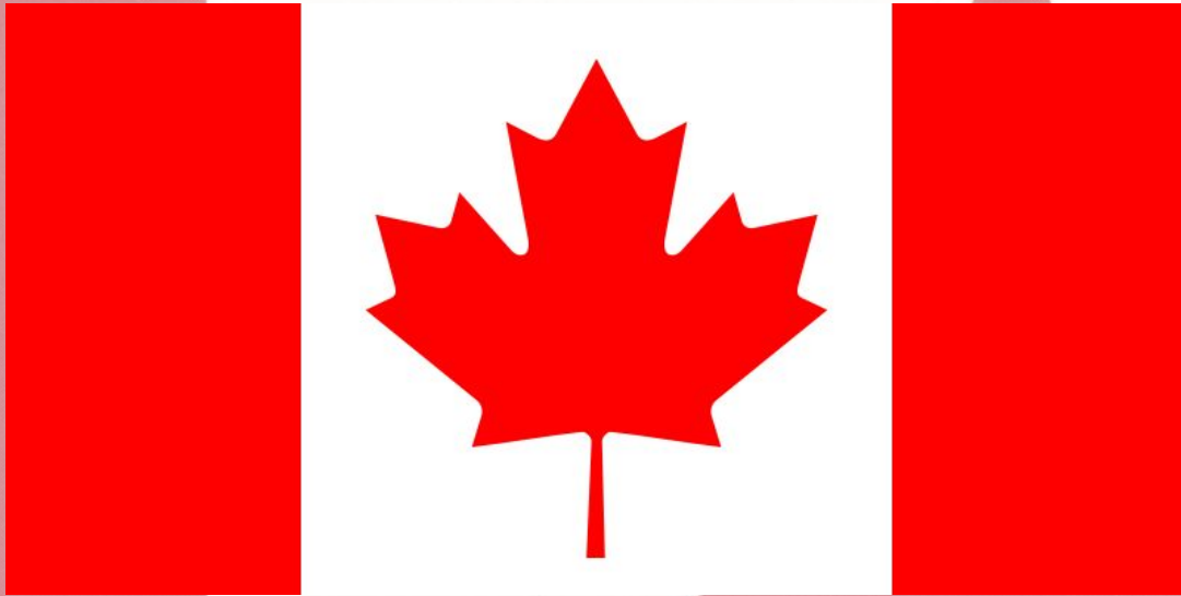
Flag of Canada