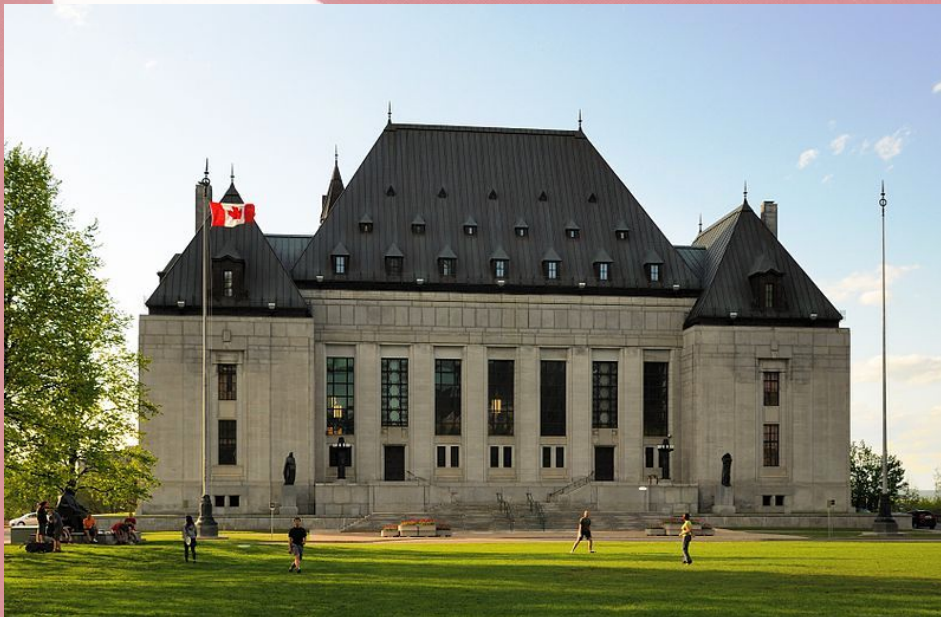
The Supreme Court of Canada in Ottawa, west of Parliament Hill

The Supreme Court of Canada is the highest court and final arbiter and has been led since 2000 by the Chief Justice Beverley McLachlan (the first female Chief Justice).