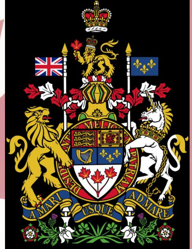
Coat of arms of Canada