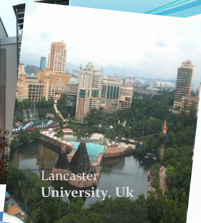
Lancaster University, UK