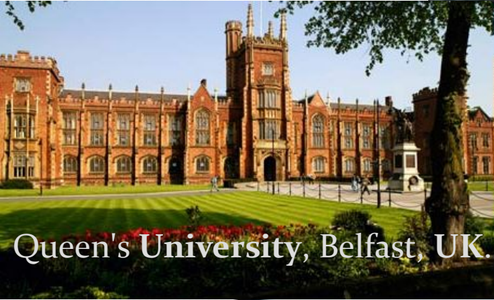
Queen's University, Belfast, UK.