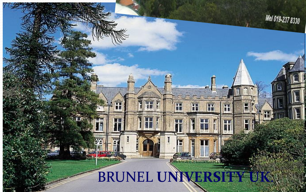
BRUNEL UNIVERSITY UK