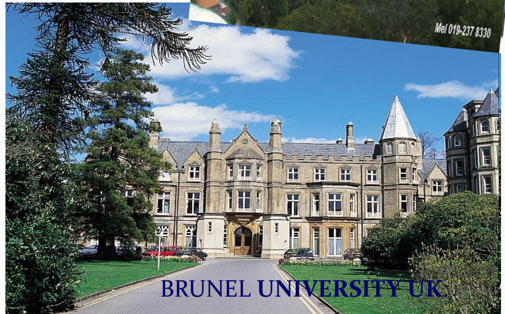
BRUNEL UNIVERSITY UK