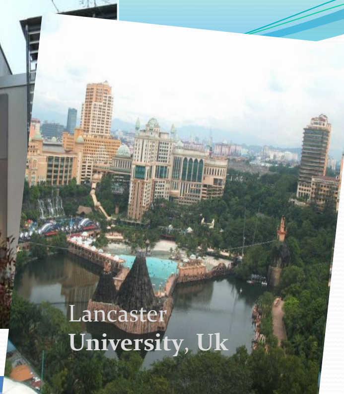
Lancaster University, UK