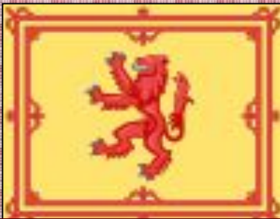
Royal Standard of Scotland