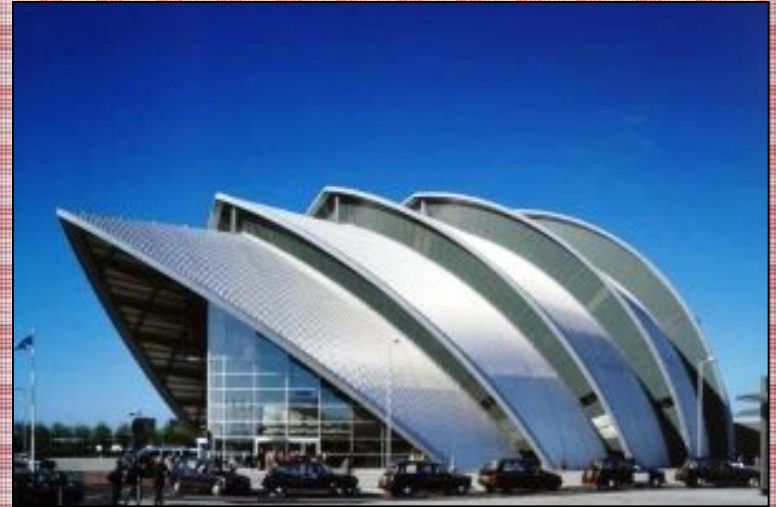
Scottish Exhibition & Conference Center