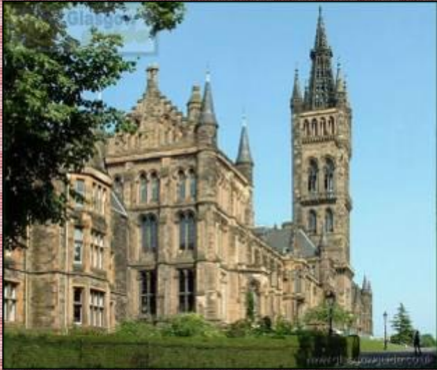
Glasgow International College