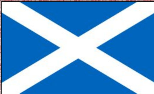
flag of Scotland