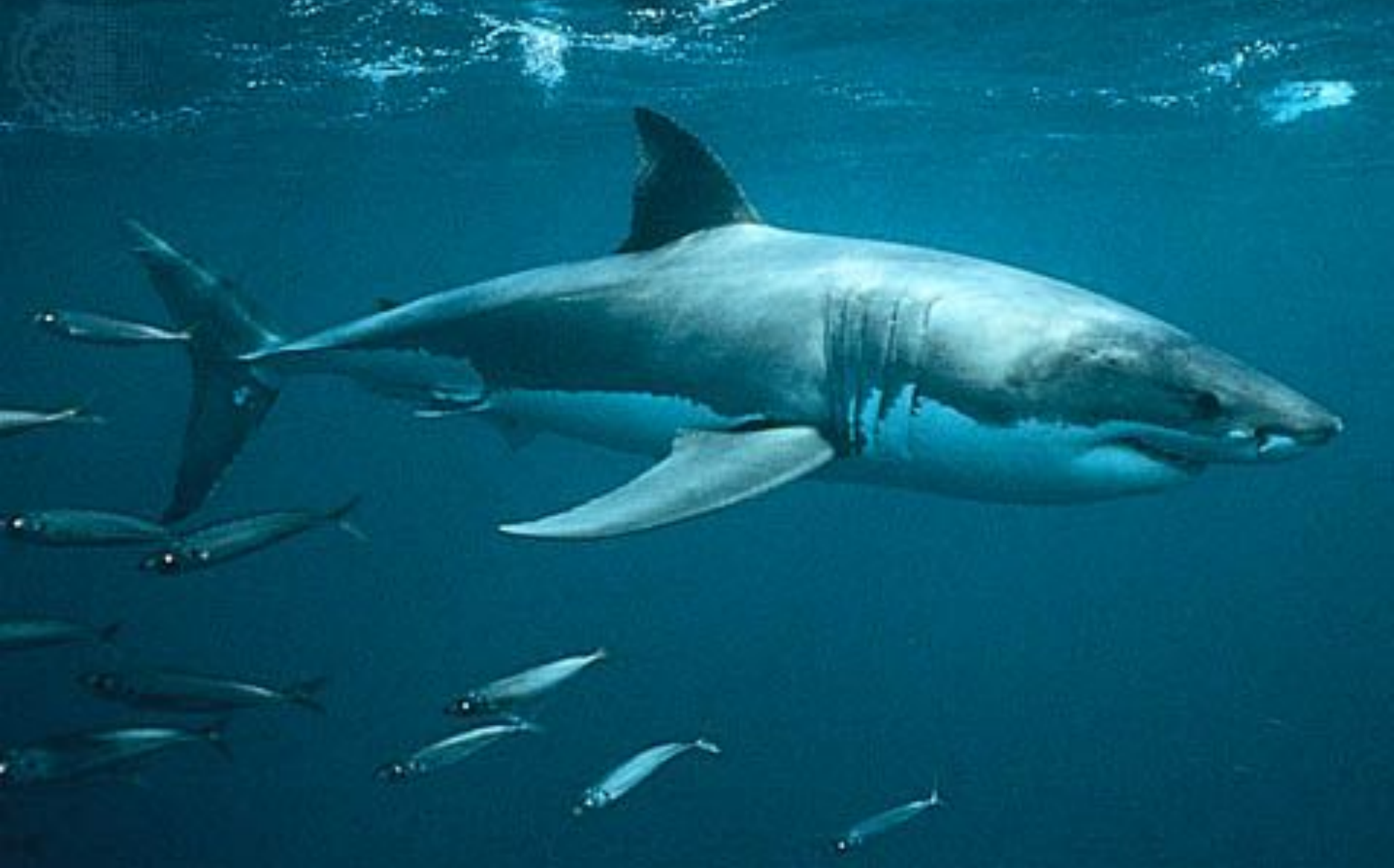
A white shark