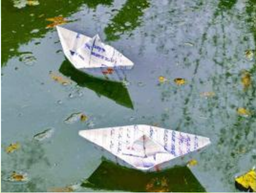
to run boats