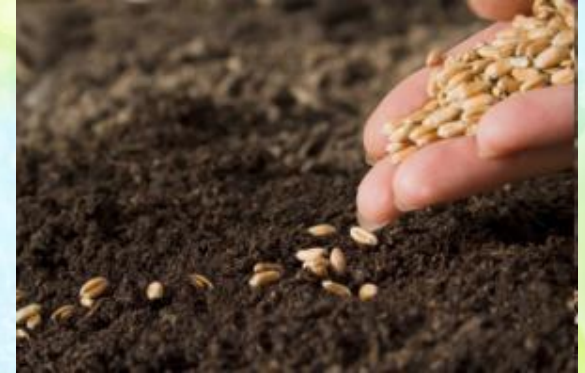
to plant seeds