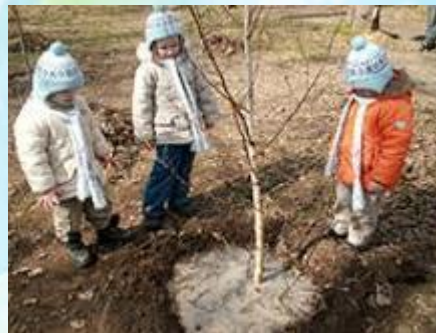
to plant trees