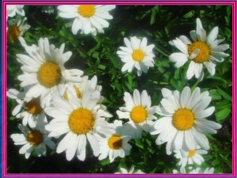
Summer is bright