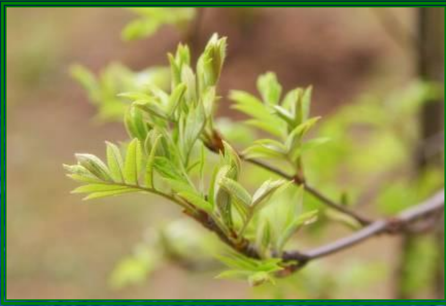
Spring is green