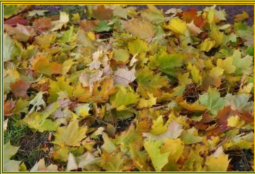
Autumn is yellow