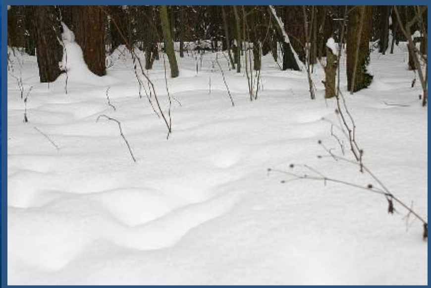
Winter is white