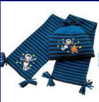
knitted hat and scarf