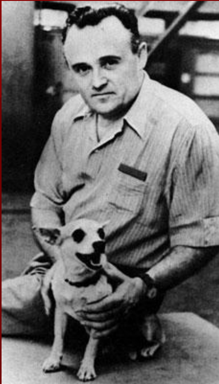
Sergei Korolev and a dog Laika