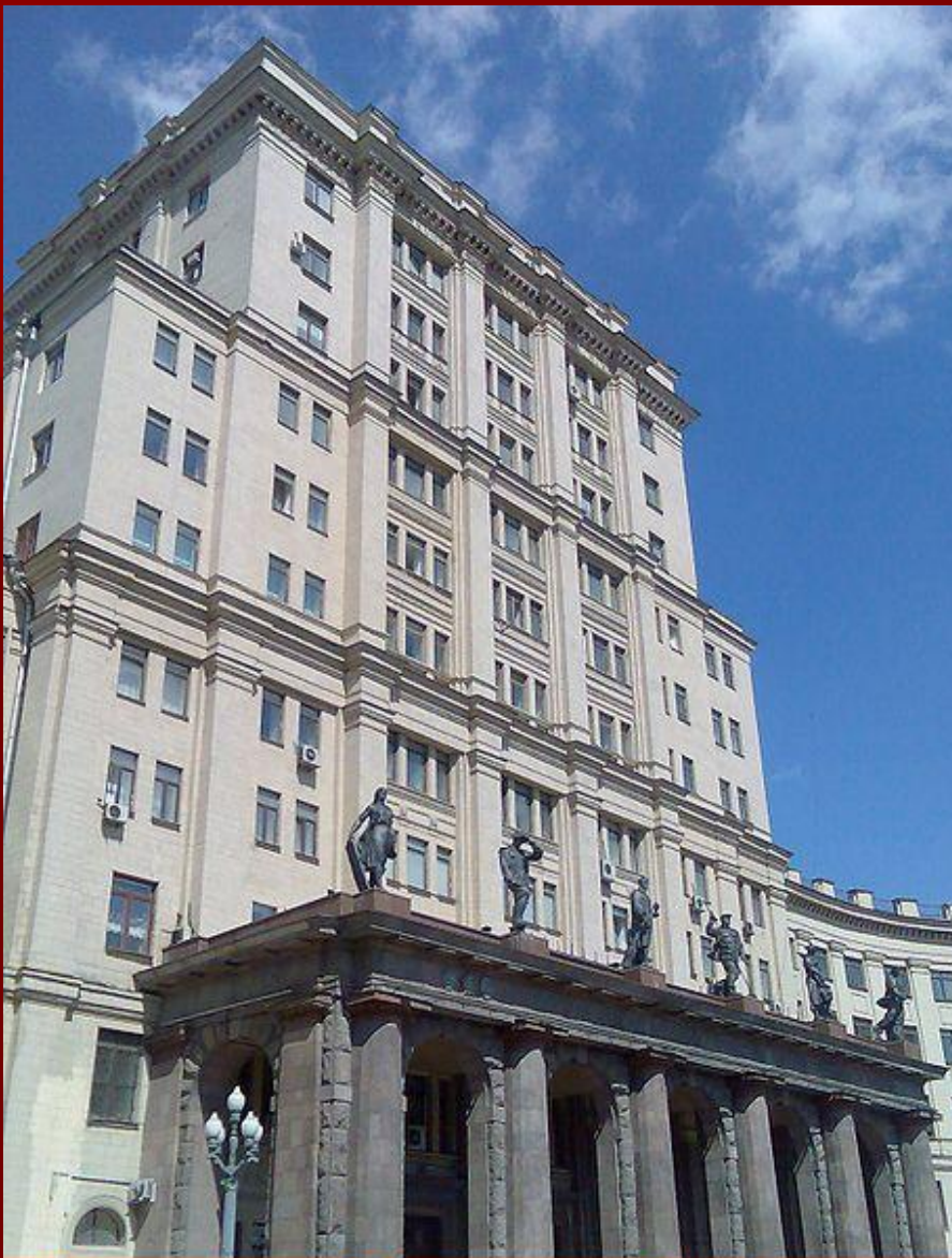
Bauman Moscow State Technical University

In 1925 he was accepted into a limited class on glider construction. He was allowed to fly the training glider on which he worked, but ended up with two broken ribs. In 1926 he was accepted into the Bauman Moscow State Technical University.