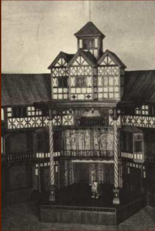
Entrance of The Globe Theater