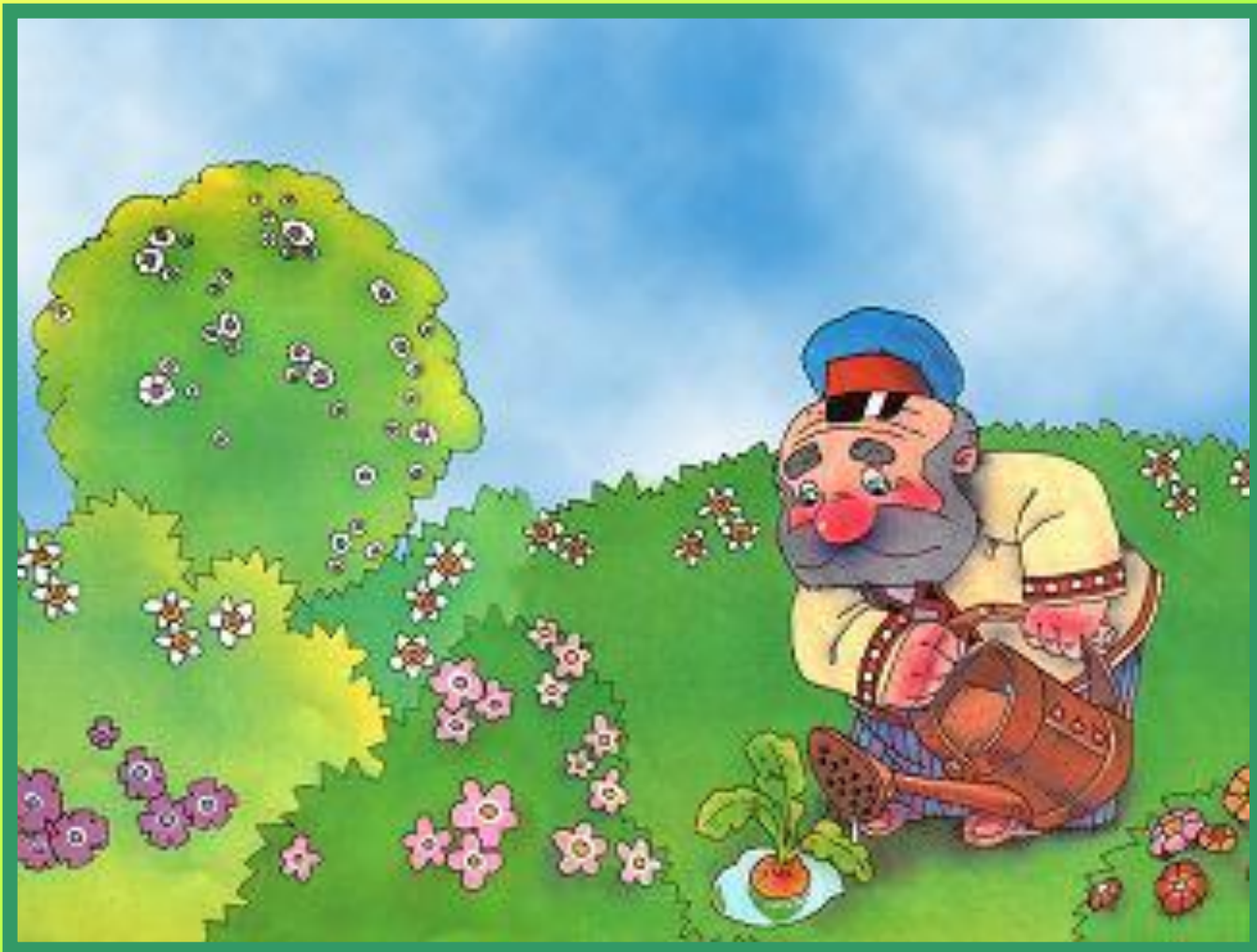
Grandpa planted a turnip.