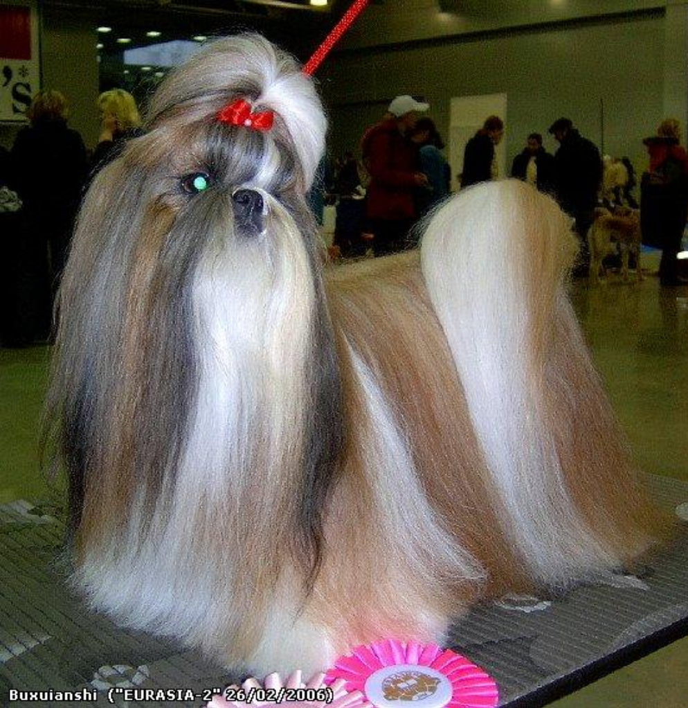
Вухуианши ("EURASIA-2" 26/02/2006)

I've seen that dog and pony show so many times. I know all the words and replies.