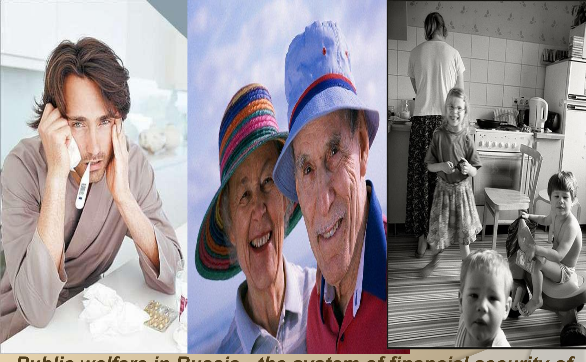
Public welfare in Russia - the system of financial security of Russian citizens in old age, sickness, support for needy families, etc.