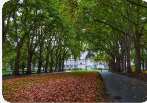
Royal Exhibition Building