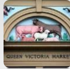
Queen Victoria Market