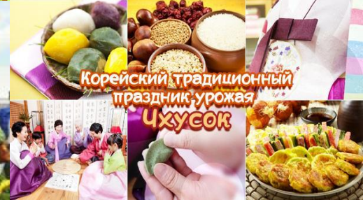
Chuseok (Korean Thanksgiving Day)