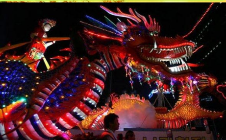
Seollal (New Year according to the lunar calendar) (January 26)