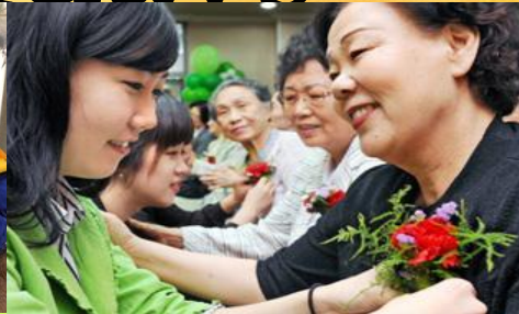
Parent's Day (May 8)