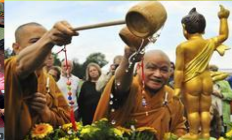
Buddha's Birthday (May 12, 2008)