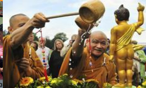
Buddha's Birthday (May 12, 2008)