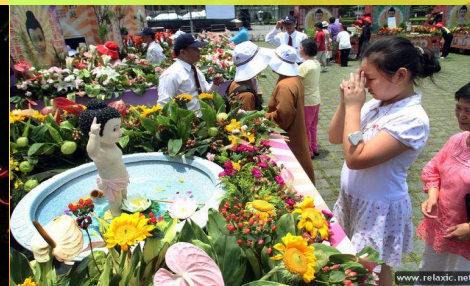
Labor Day (May 1)