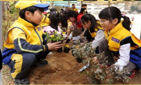
Tree Planting Day (April 5)