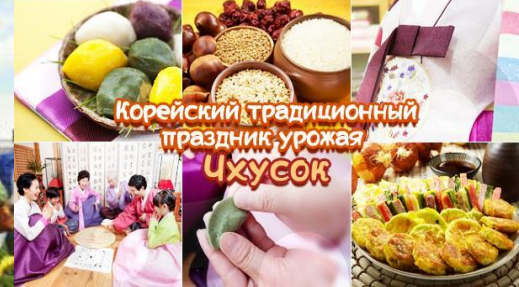
Chuseok (Korean Thanksgiving Day)