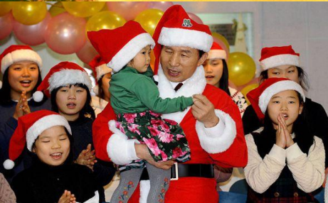
New year on the solar calendar (January 1)