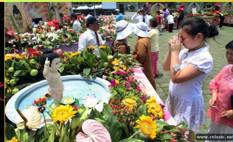
Labor Day (May 1)