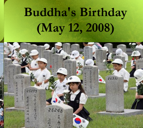
Memorial Day (June 6)