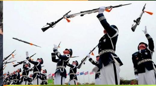
Constitution Day (July 17)