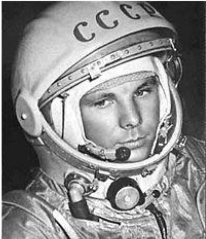
Yuri Gagarin in space suit