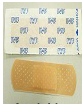
A sticking plaster