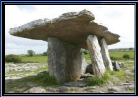
Poulnabrone dolmen, Ireland.