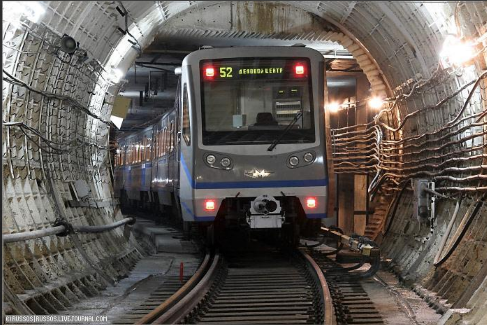
An underground rapid transit rail system