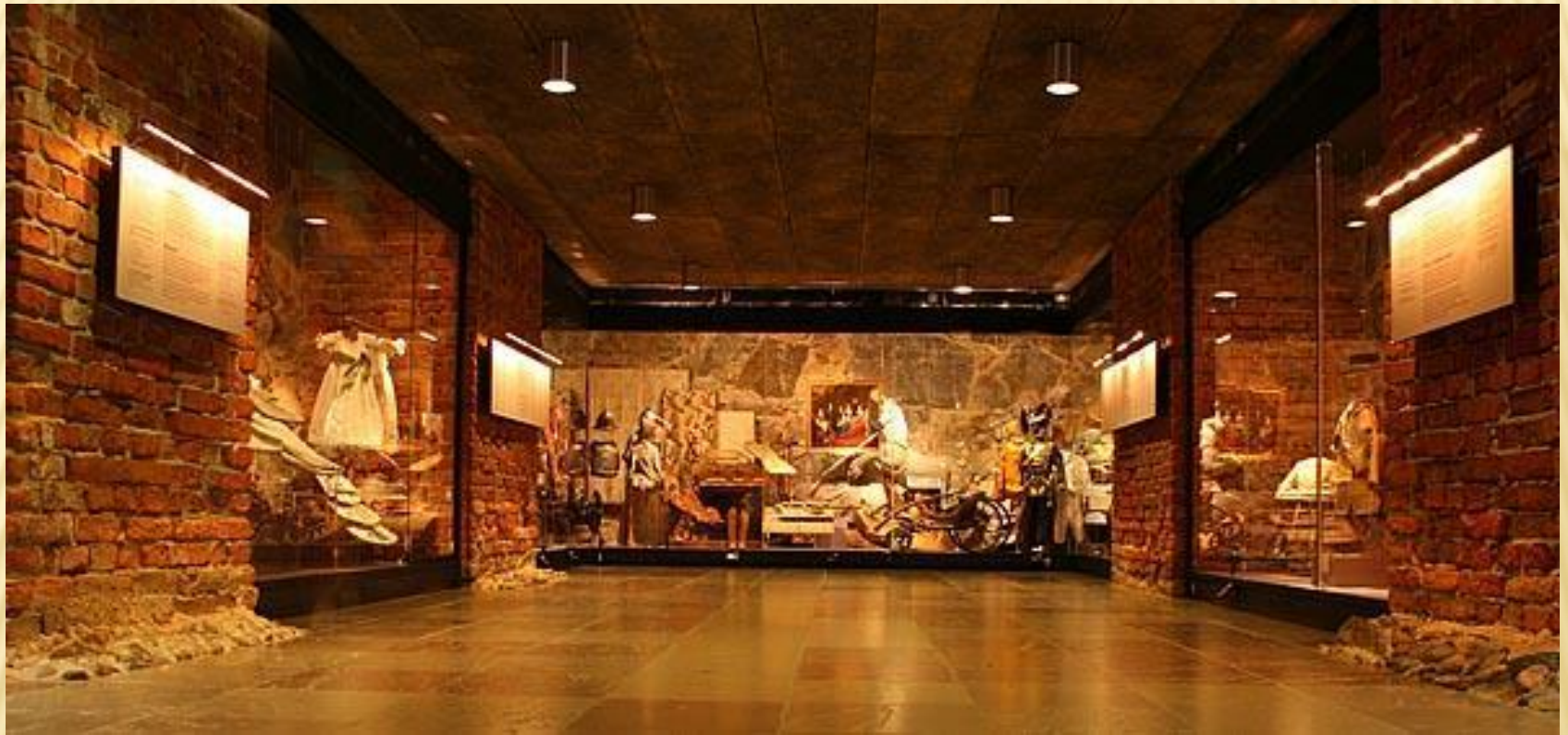
the armoury in Stockholm