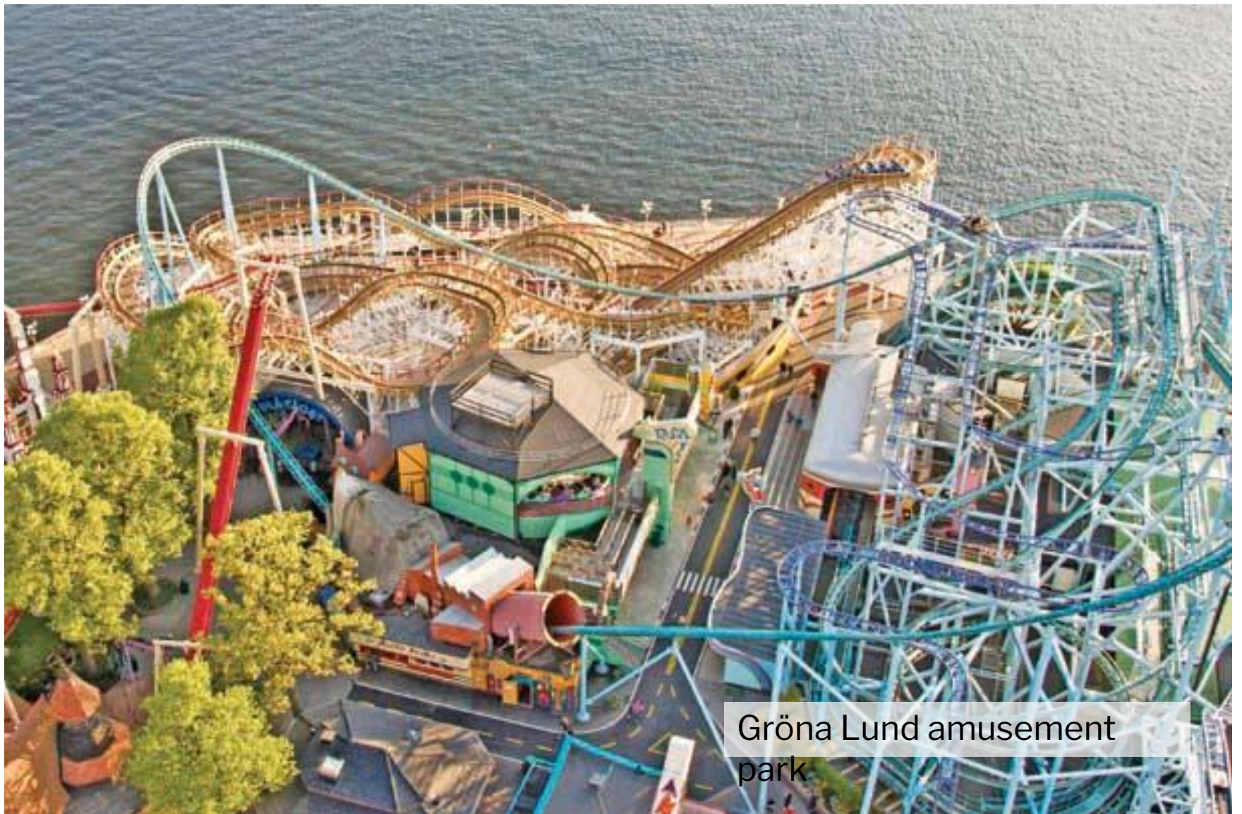
Gröna Lund amusement park