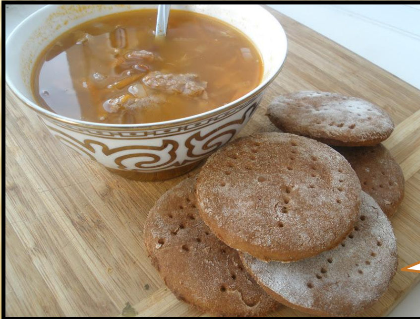
salty soup with sweet cakes