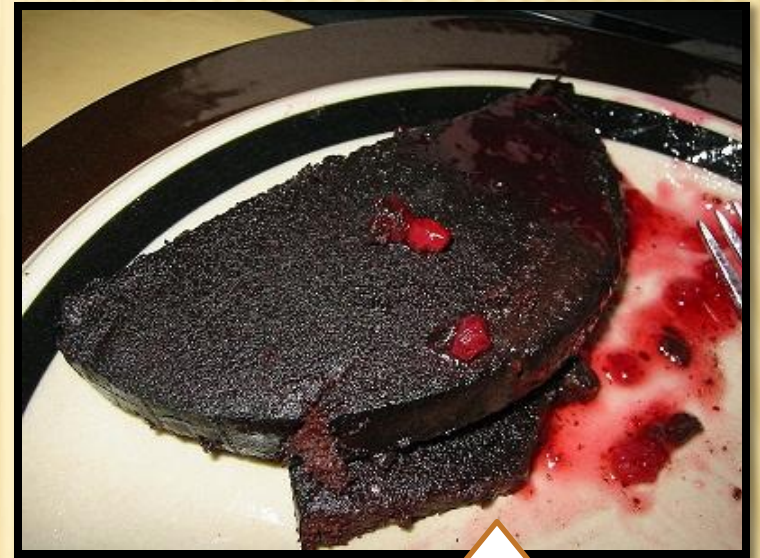
meat with jam