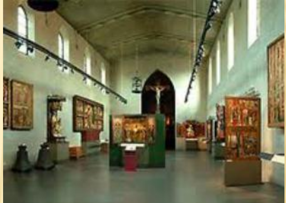
the Museum of Antiquities