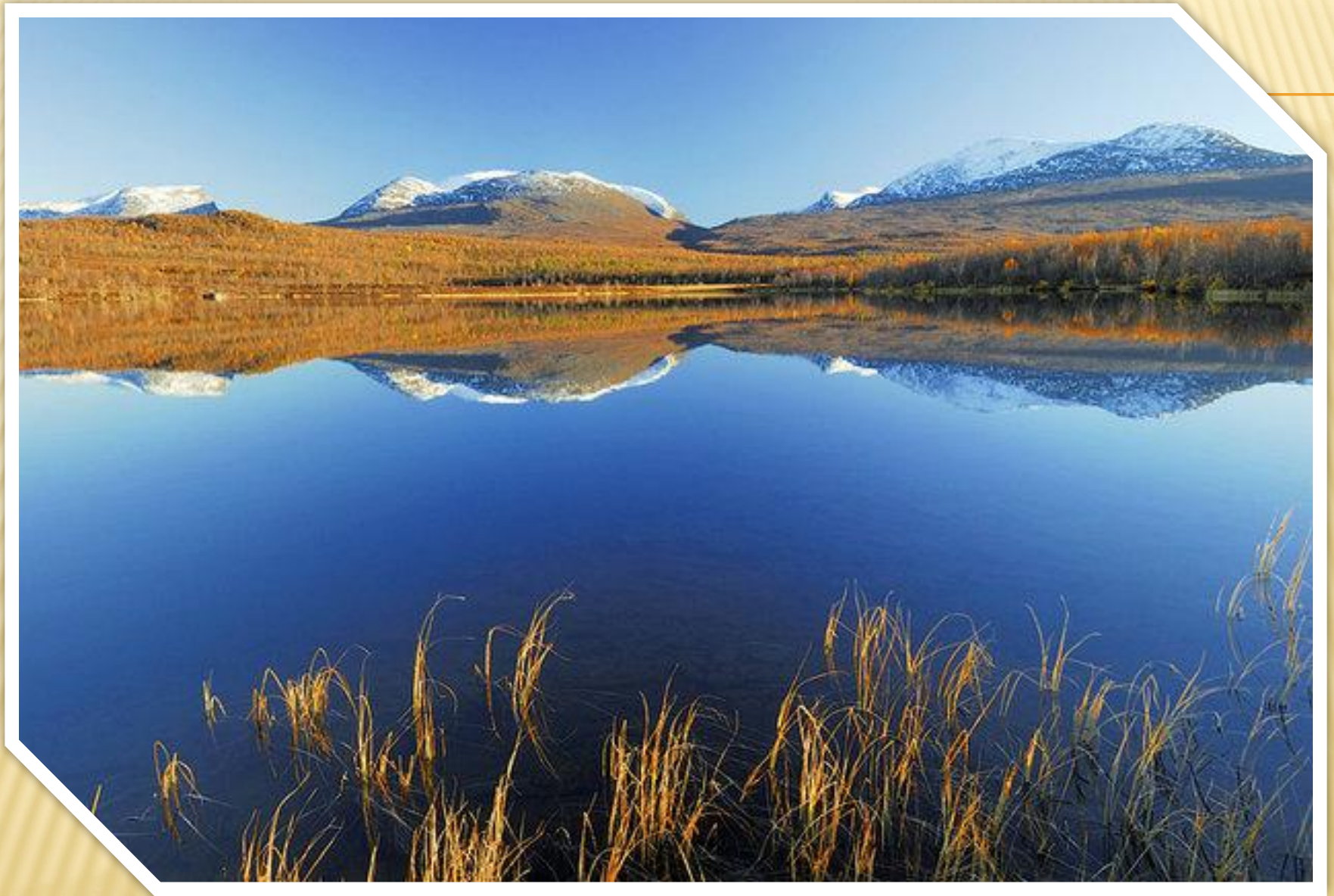
Sweden unspoiled nature