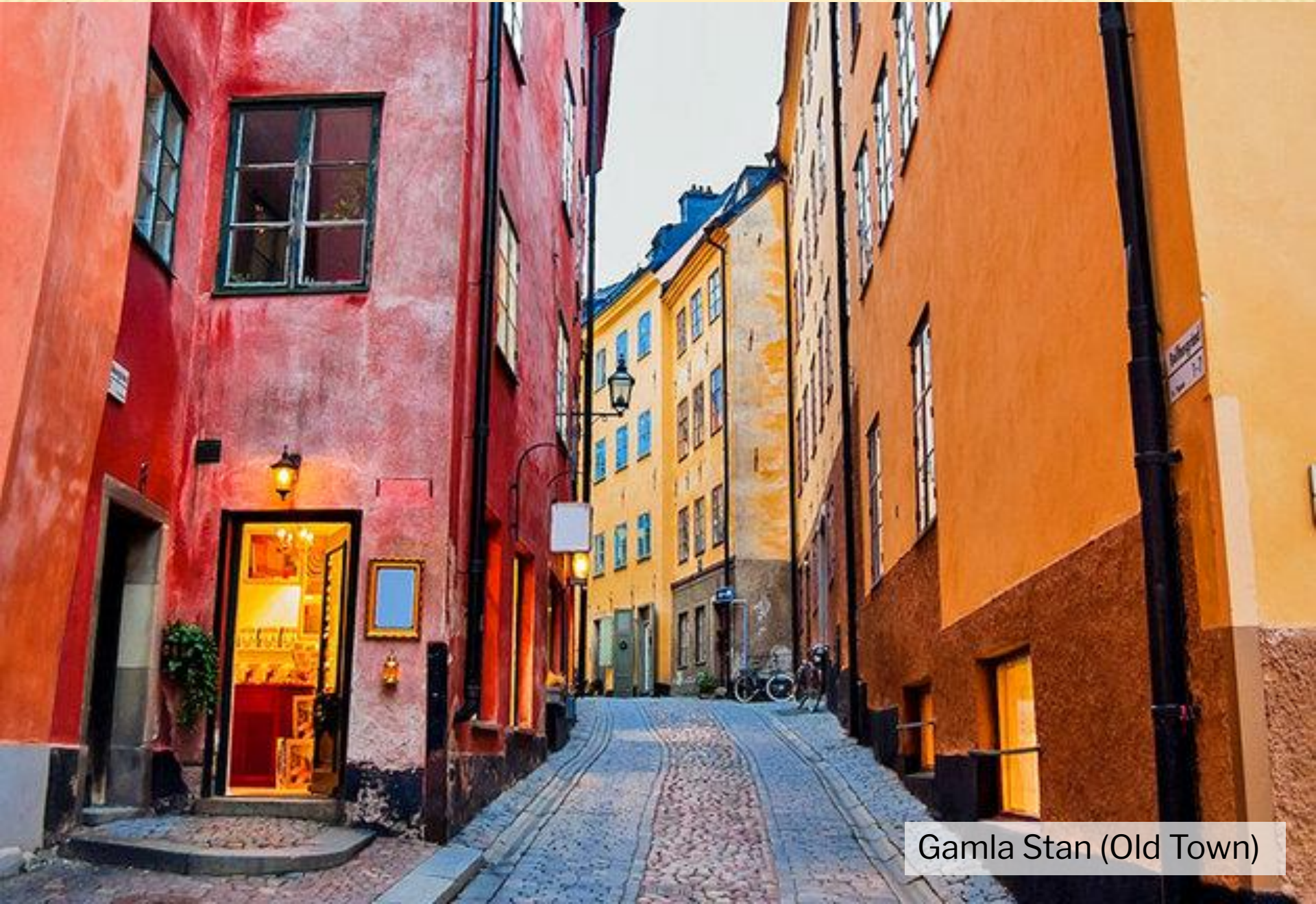
Gamla Stan (Old Town)