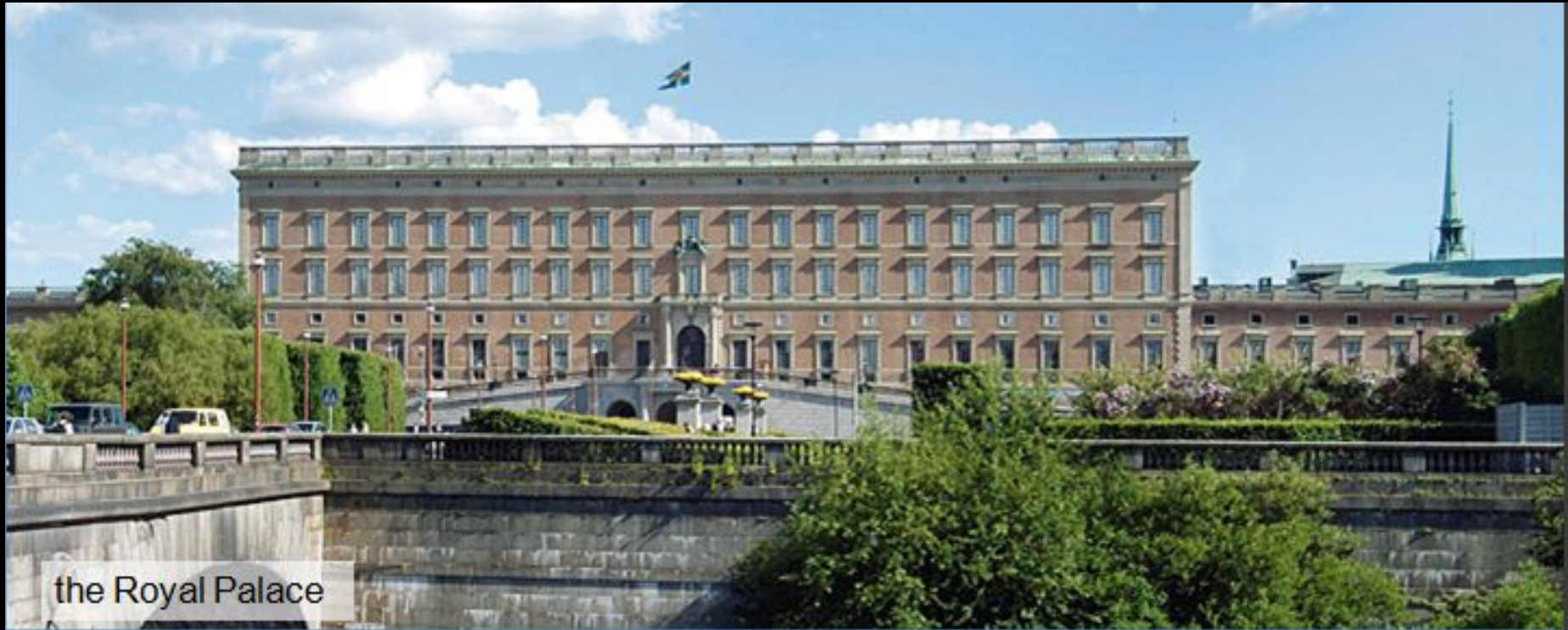
the Royal Palace