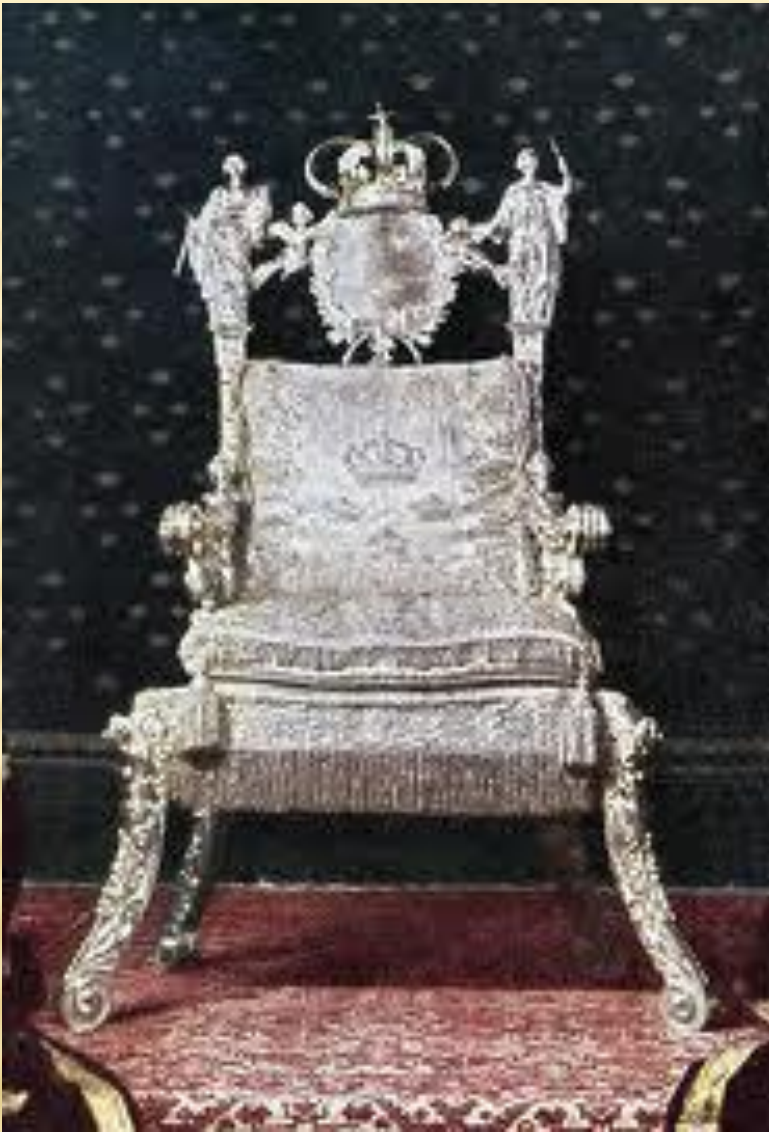
queen kristina's silver throne