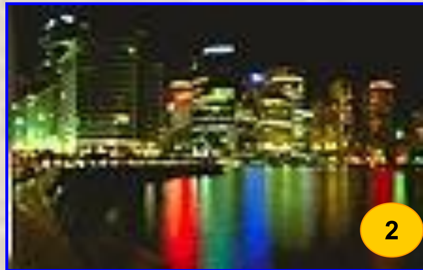
1. The Ferry