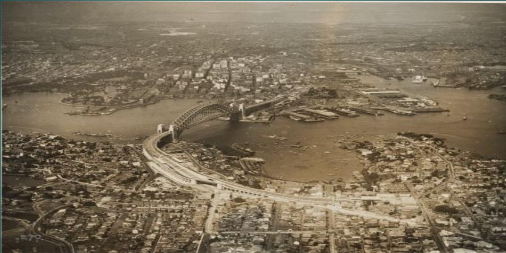
Sydney harbour in 1932

The site of the first British colony in Australia, Sydney was established in 1788 at Sydney Cove by Captain Arthur Phillip. The original name was intended to be Albion, but Phillip named the settlement after the British Home Secretary, Thomas Townshend, Lord Sydney, in recognition of Lord Sydney's role in issuing the charter authorising Phillip to establish the colony.