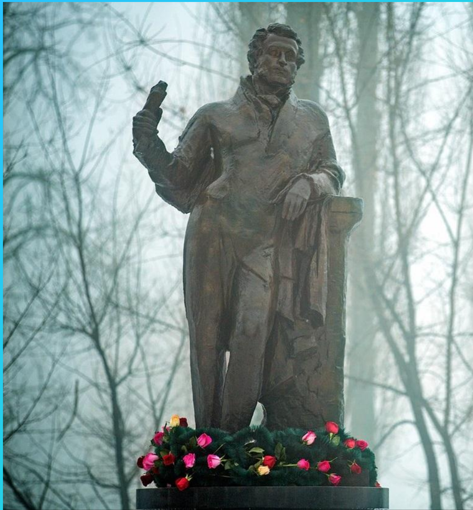
A. Pushkin`s monument