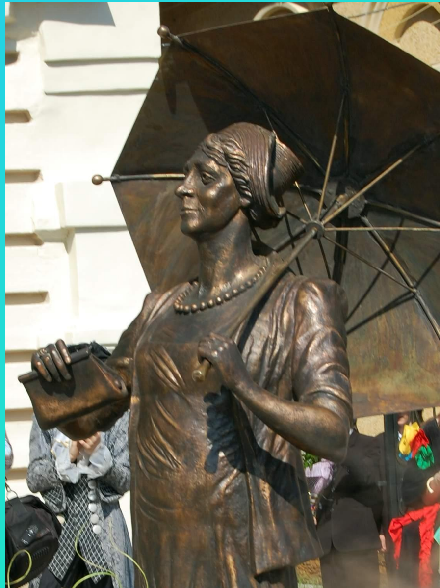
F. Ranevskaya`s monument