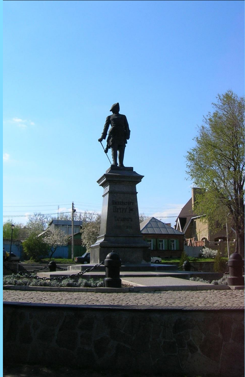
Peter the First's monument