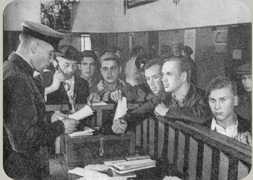
The first day of mobilization in Oktyabrski region of Tambov.

Tambov region had a large mobilization potential. In the first days of the war the military commissioners received numerous applications from volunteers to send them to the front. With the help of the Communists and Komsomol members the communist battalion was formed which consisted of 500 people and it was sent to the Byelorussian Front. Most of the warriors of the battalion were killed, but at the cost of their lives, they stopped the enemy at his front.