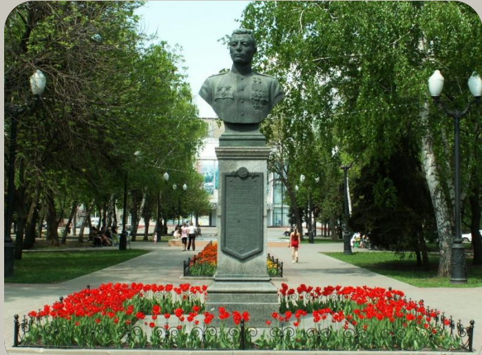
The monument of Petrov V.S., the hero of the Soviet Union