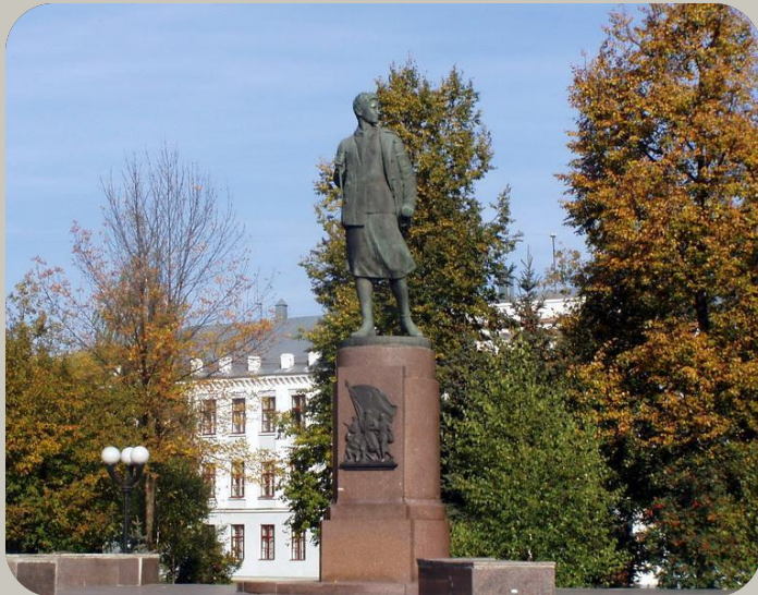
The monument of Zoya Kosmodemyanskaya, the hero of the Soviet Union

Tambov people fought on all fronts, both in the regular Red Army units and in partisan detachments in the temporarily-occupied territory, in the Resistance movement in Italy, France, Belgium. More than 260 Tambov warriors were awarded the title Hero of the Soviet Union. Full Cavalier of the Order of Glory was given more than 50 people.