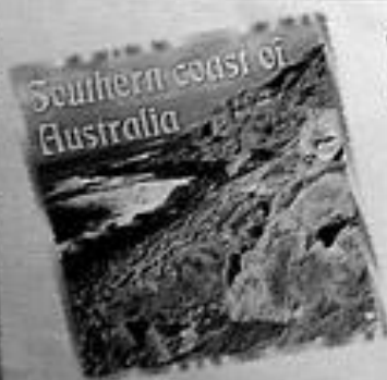
Southern coast of Australia