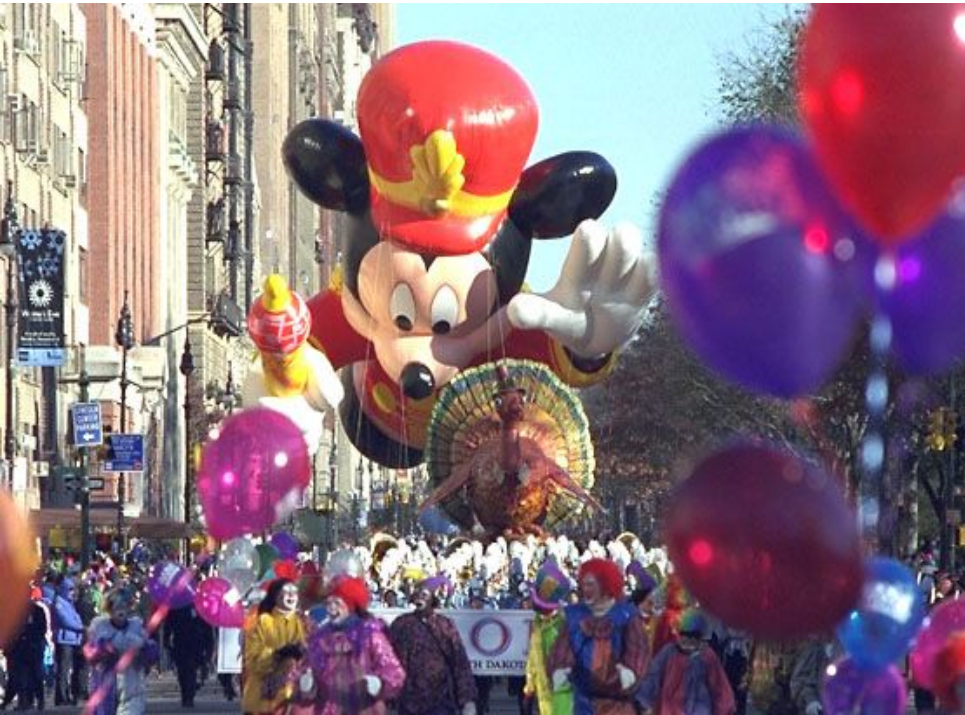
MACY'S PARADE IN NEW-YORK.