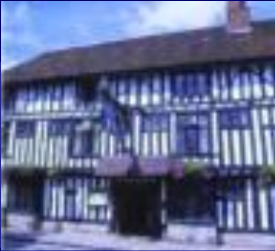
Stratford Upon Avon