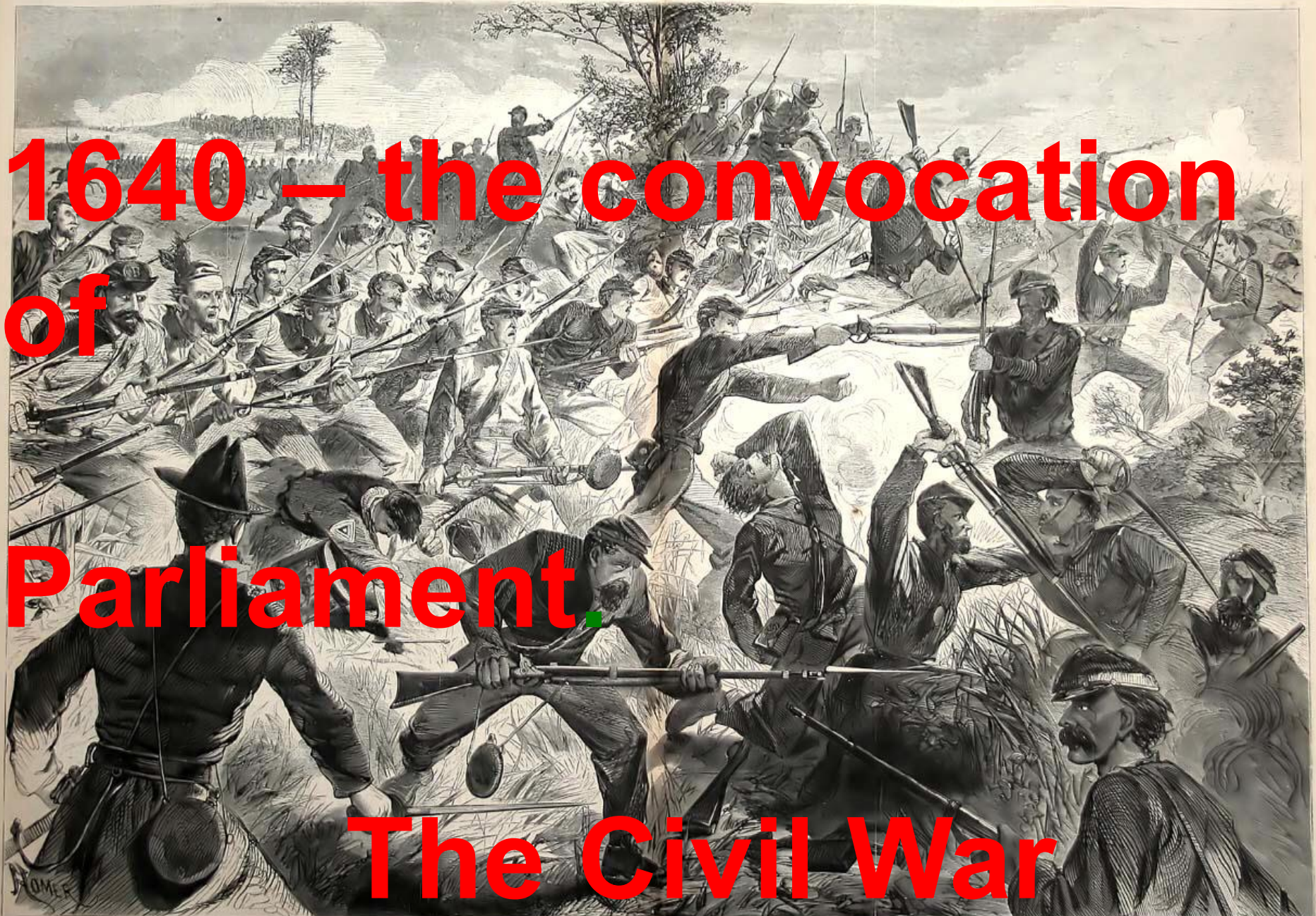
THE WAR FOR THE UNION, 1862—A BAYONET CHARGE.—[SEE PAGE 420.]