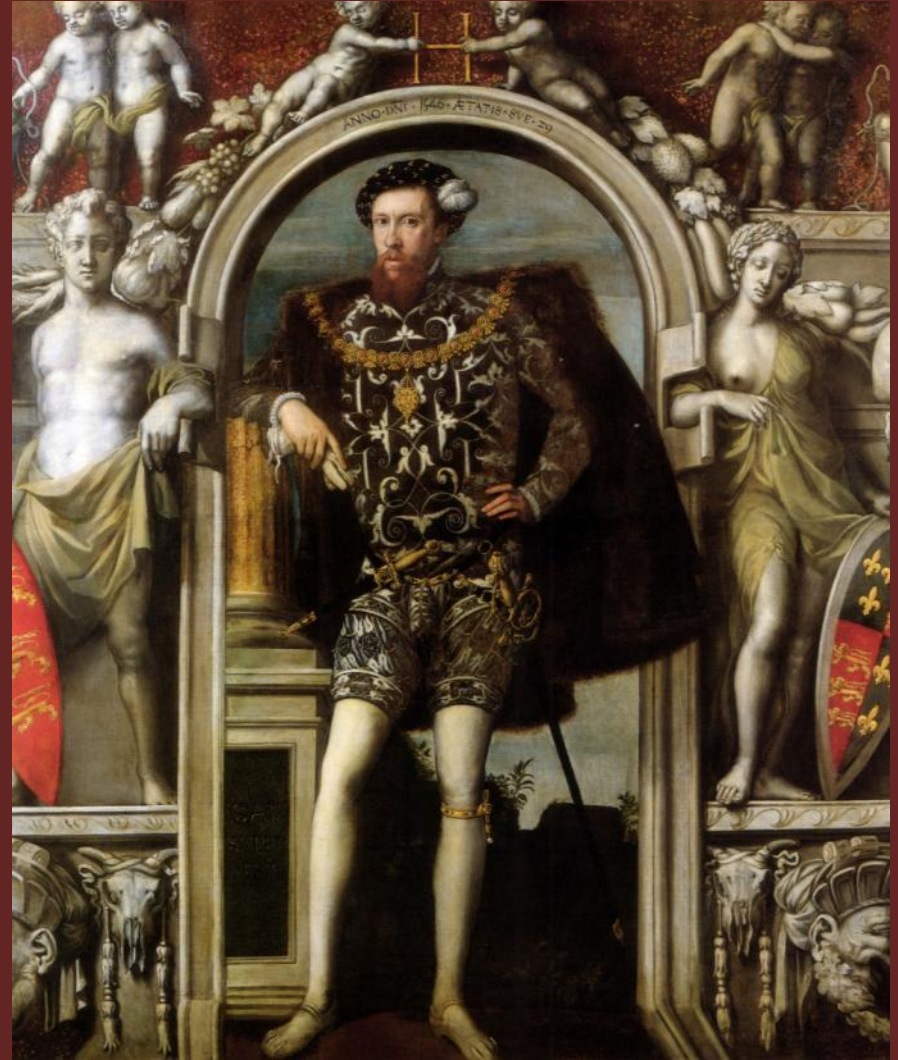
Henry Howard, Earl of Surrey at age 29, 1546. Unknown author

received his title when his father became duke of Norfolk. He fought in Scotland and in Flanders and became commander of a garrison of Boulogne. Quick-tempered and quarrelsome, he made many enemies and was imprisoned several times for misconduct. Arrested on false charges of treason, he was executed in 1547. As with other Elizabethans, his poetry was somewhat secondary to his other activities, but he was technically skilled and, like Wyatt, an enthusiast of the Italian sonnet.