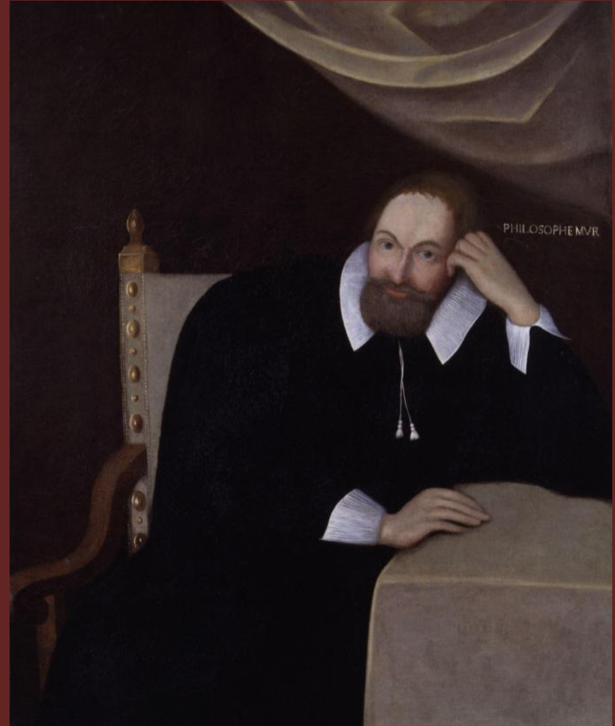
Sir Henry Wotton, by unknown artist.

was born in Kent and was educated at Winchester and Oxford. He wrote a play and was a friend of John Donne, but his interests appear to have been mainly scientific. He obtained a diplomatic post under the second Earl of Essex, whose downfall prompted him to leave England for Italy rather rapidly. He later traveled to Scotland to warn James VI of a plot to murder him. When James acceded to the English throne, Wotton was knighted and became ambassador to Venice. He is credited with the saying that an ambassador is a honest man sent to lie abroad for the good of his country. His poems were published in 1651.