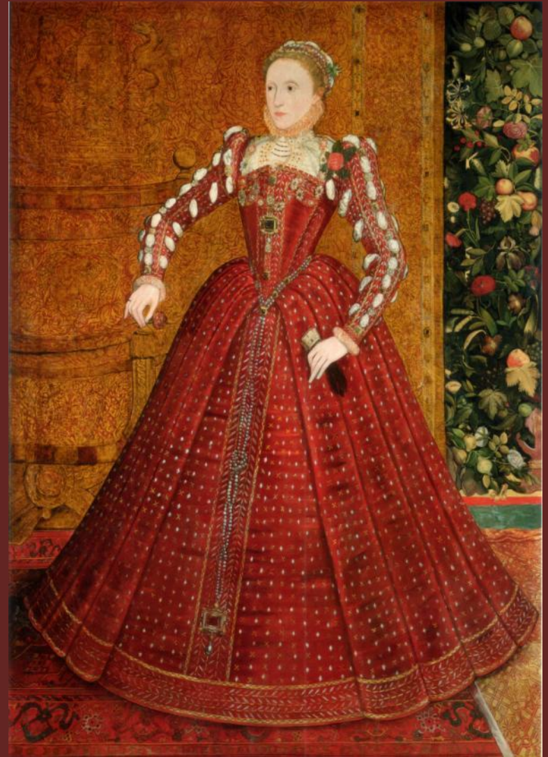
Elizabeth I. The "Hampden" portrait, by Steven van der Meulen

The Elizabethan poets (Sixteenth Century and shortly after) appeared in England during a period roughly contemporaneous with the reign of Queen Elizabeth I (1558-1603).