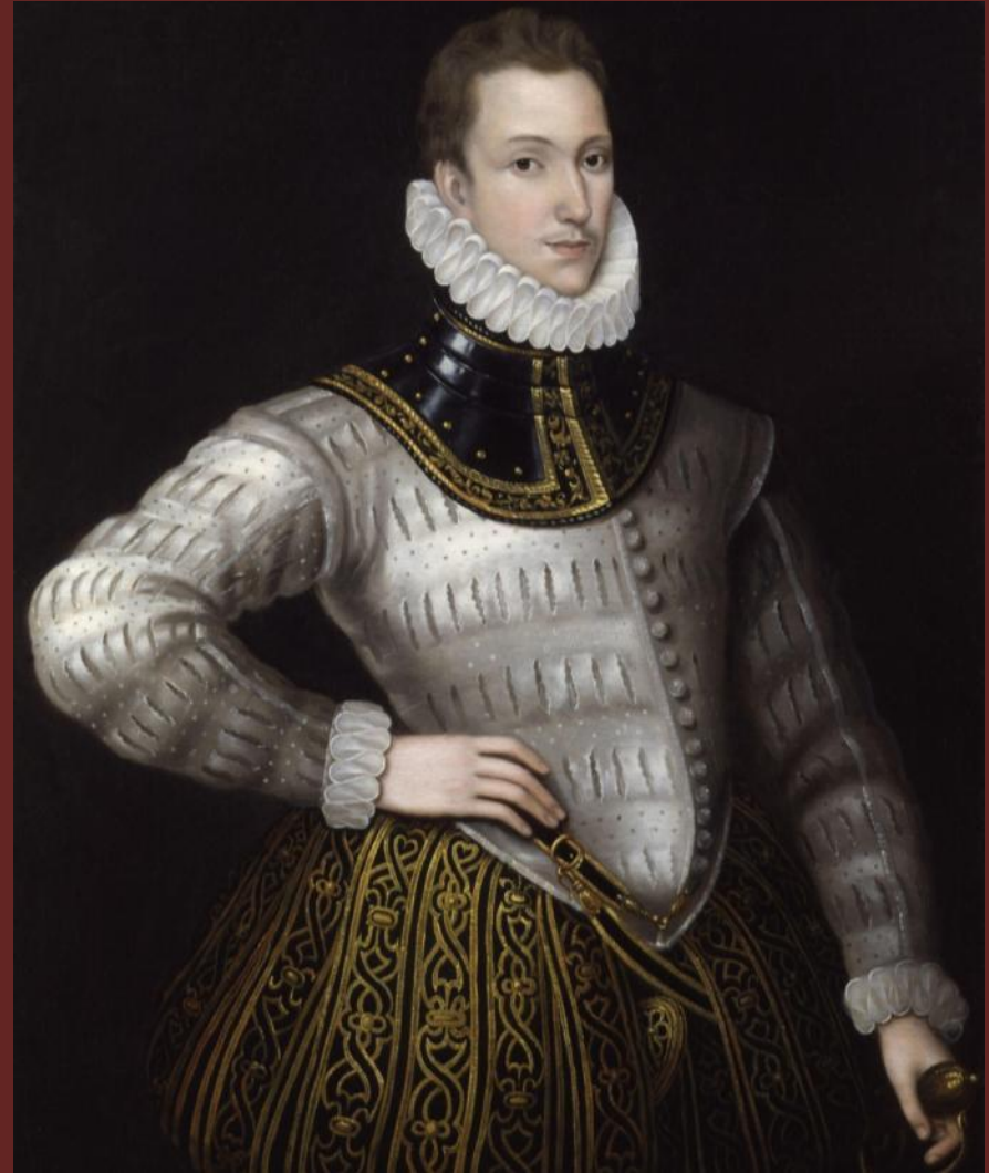
Sir Philip Sidney, by unknown artist

was a courtier, soldier, and poet. Born Kent, and educated at Oxford he was sent by Elizabeth I on diplomatic missions and was considered one of her favorites. He fell out of favor at one point but was subsequently appointed governor of Vlissingen in the Netherlands, taking part in an expedition aiding the Netherlands against Spain. Sidney died of wounds received in a raid on a Spanish convoy. His best known poetic works are some 108 sonnets about unrequited love (Astrophel and Stella), and a pastoral romance (Arcadia). He defended of poetry against the Puritans in An Apologie for Poetrie.