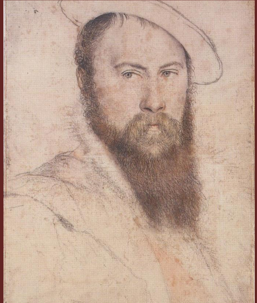
Portrait of Sir Thomas Wyatt, by Hans Holbein the Younger, c. 1535–37

born at Allington, Kent, and educated at Cambridge, was in and out of favor with Henry VIII, whom he served in a number of offices. He was repeatedly in jail—for associating with Anne Boleyn, quarreling with the duke of Suffolk, and on charges of treason. He was knighted in 1537 and served two years as ambassador to Charles V. He translated some of Petrarch's sonnets, as well as writing many of his own and other lyrics and songs.