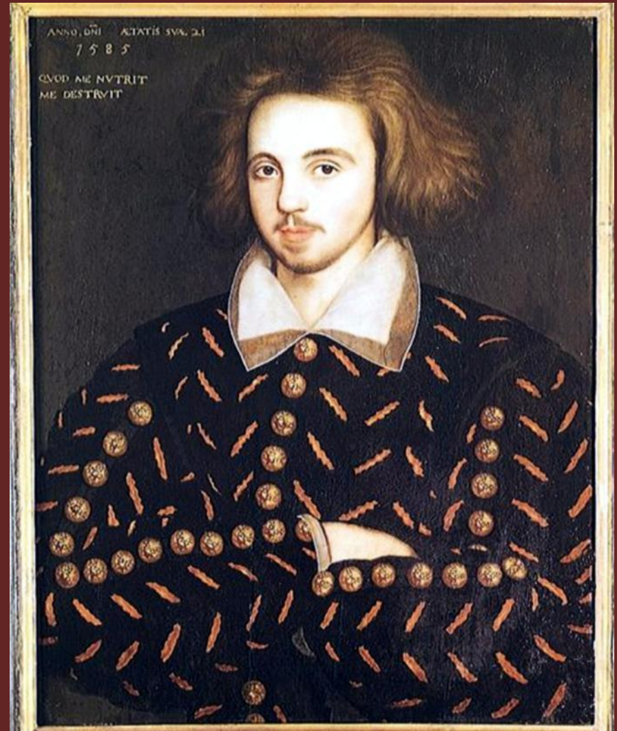
An anonymous portrait in Corpus Christi College, Cambridge believed to show Christopher Marlowe .

was born in Kent and educated at Cambridge. He became connected with a company of actors for whom he wrote plays. He was also said to be a secret agent and to have led the adventurous life typical of English agents. Denounced as a heretic, he inadvertently avoided further action against him by being murdered in a tavern brawl. While he is most famous as the first great English playwright (Dr. Faustus, Tamerlane the Great, etc.), he also wrote poetry and translated some of the poems of Lucan and Ovid.