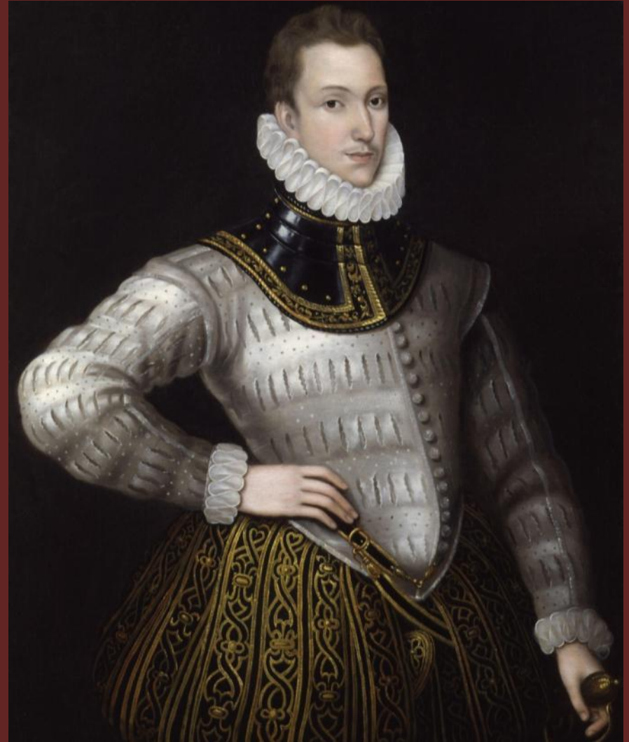
Sir Philip Sidney, by unknown artist

was a courtier, soldier, and poet. Born Kent, and educated at Oxford he was sent by Elizabeth I on diplomatic missions and was considered one of her favorites. He fell out of favor at one point but was subsequently appointed governor of Vlissingen in the Netherlands, taking part in an expedition aiding the Netherlands against Spain. Sidney died of wounds received in a raid on a Spanish convoy. His best known poetic works are some 108 sonnets about unrequited love (Astrophel and Stella), and a pastoral romance (Arcadia). He defended of poetry against the Puritans in An Apologie for Poetrie.