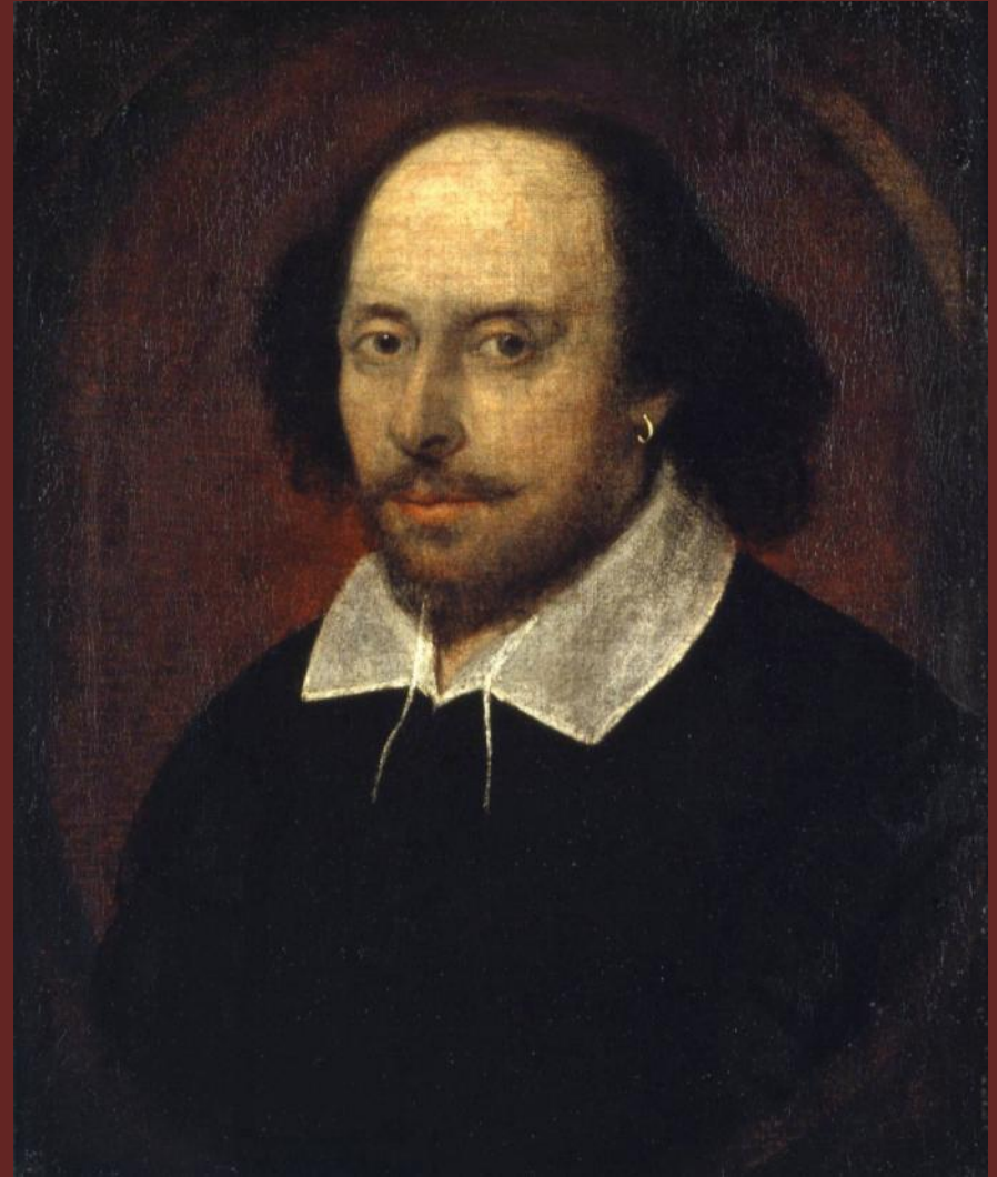
The Chandos portrait, artist and authenticity unconfirmed.

recognized as possible the world's greatest dramatist left little on record to describe his life. The poetry he used in his plays to capture character, motivation, and drama is unique and represents one of the great achievements in human expression. He also took the sonnet form that had been brought from Italy by his Elizabethan predecessors and made it his own in a sequence of sonnets that has no equal.