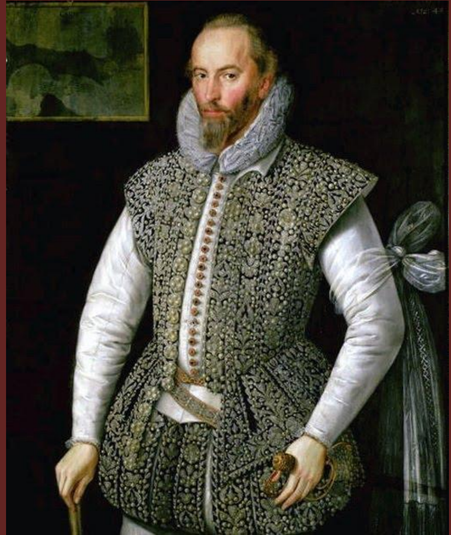
Sir Walter Raleigh by an unknown artist

was born in Devon, educated at Oxford and studied law in London. He first sailed to America in 1578 and then in 1585 attempted to sponsor the first English colony there, which failed. He became a favorite of Queen Elizabeth, who knighted him but became disenchanted with him when he secretly married one of her maids of honor.