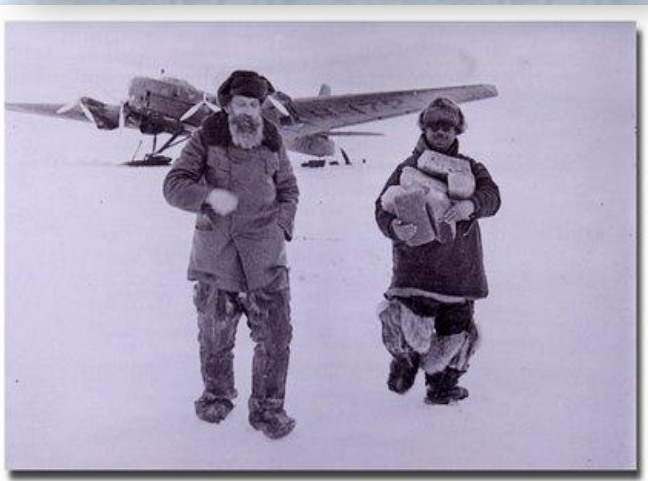
Disembarkation of the Soviet expedition to drifting ice 1937.