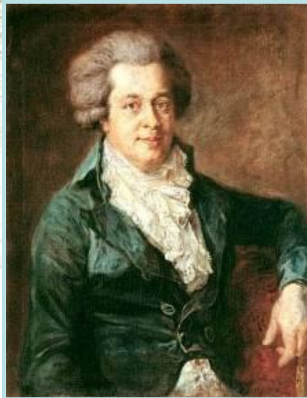
Father – Leopold Mozart