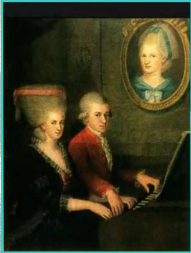
Mozart and his sister at the piano