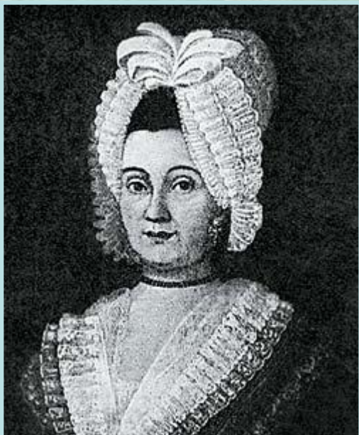
Mother – Anna Maria Pertl