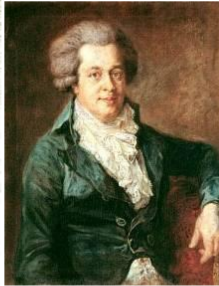
Father – Leopold Mozart