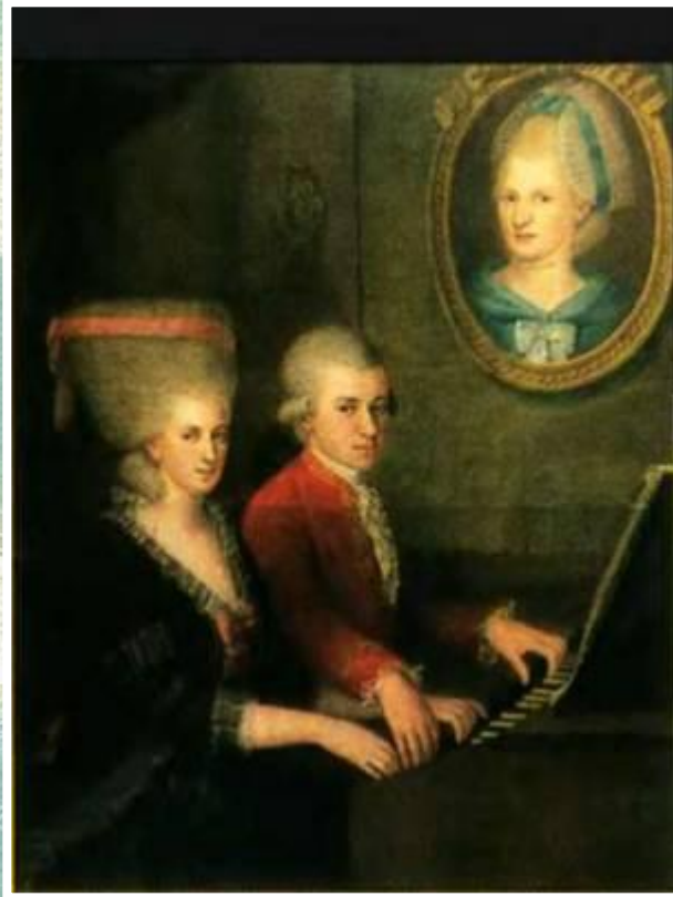
Mozart and his sister at the piano