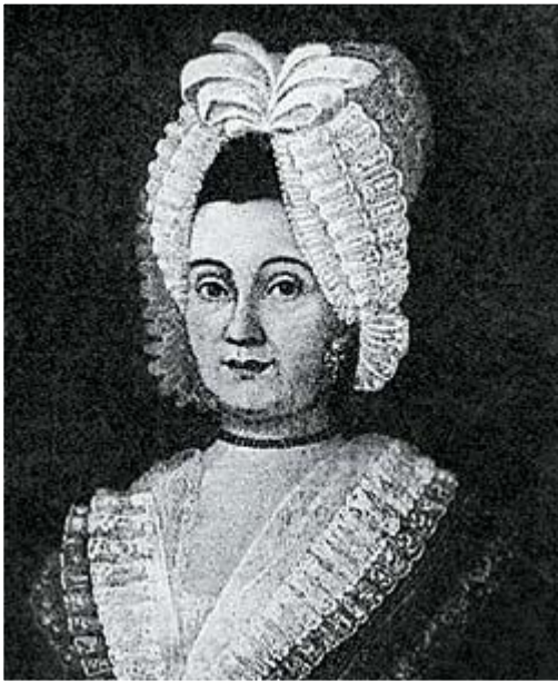
Mother – Anna Maria Pertl