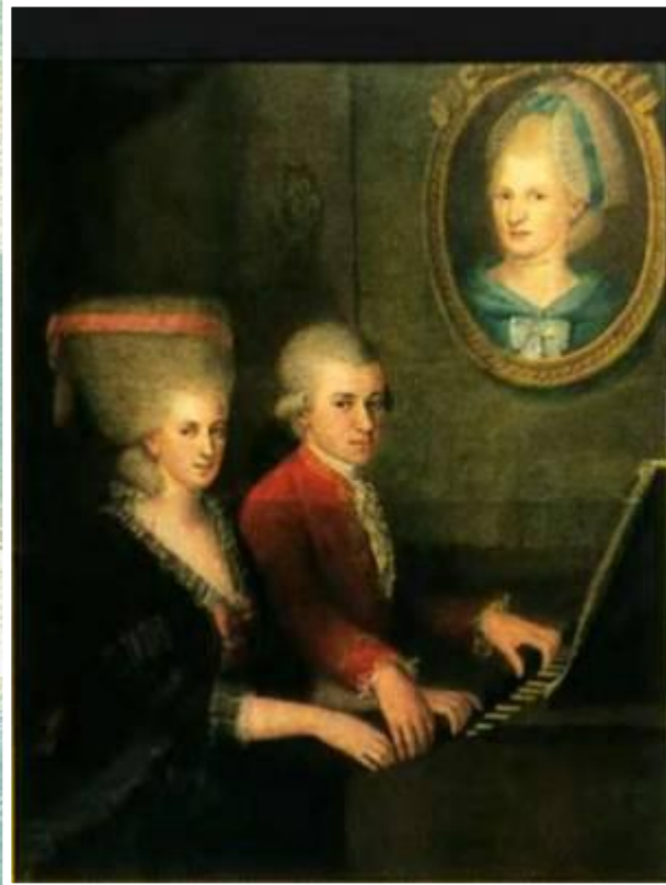
Mozart and his sister at the piano