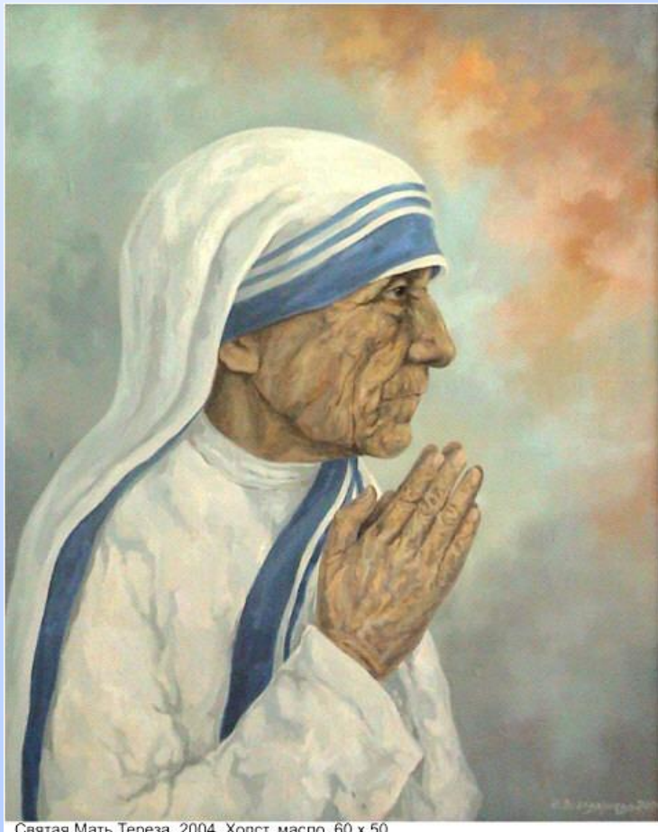
Святая Мать Тереза. 2004. Холст. масло. 60 x 50