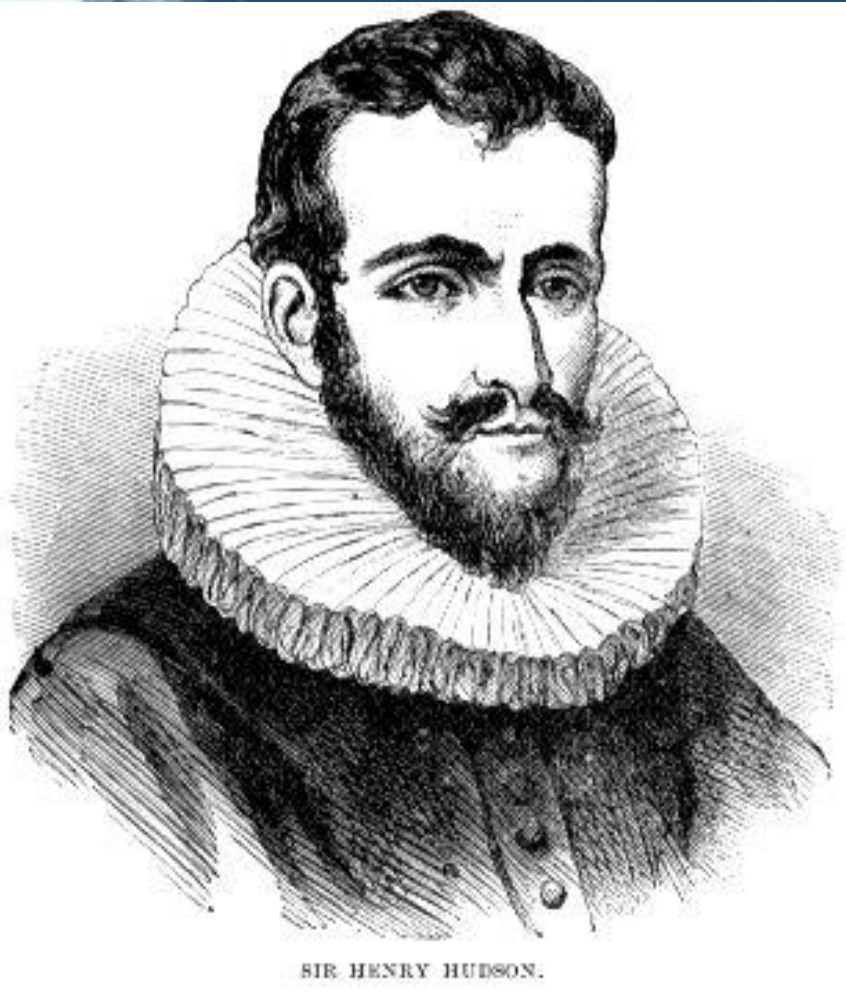
SIR HENRY HUDSON.

The mighty Hudson River is named after the navigator Henry Hudson.