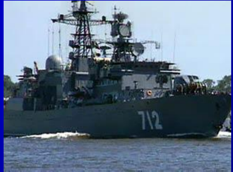
Russian frigate 'Fearless' Russian warship has joined forces with a British one to rebuff a pirate attack on a Danish civilian ship off the coast of Somalia