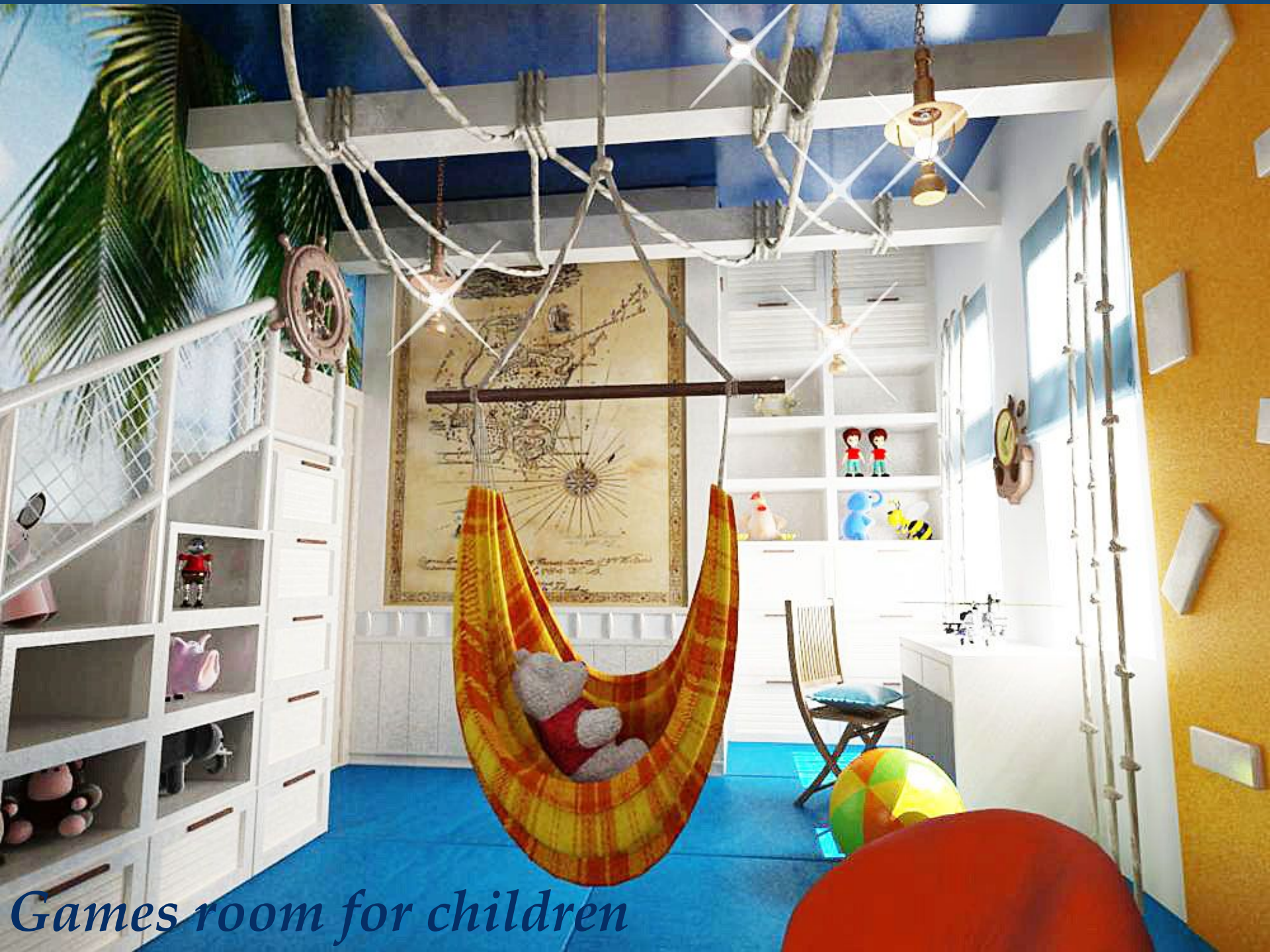
Games room for children