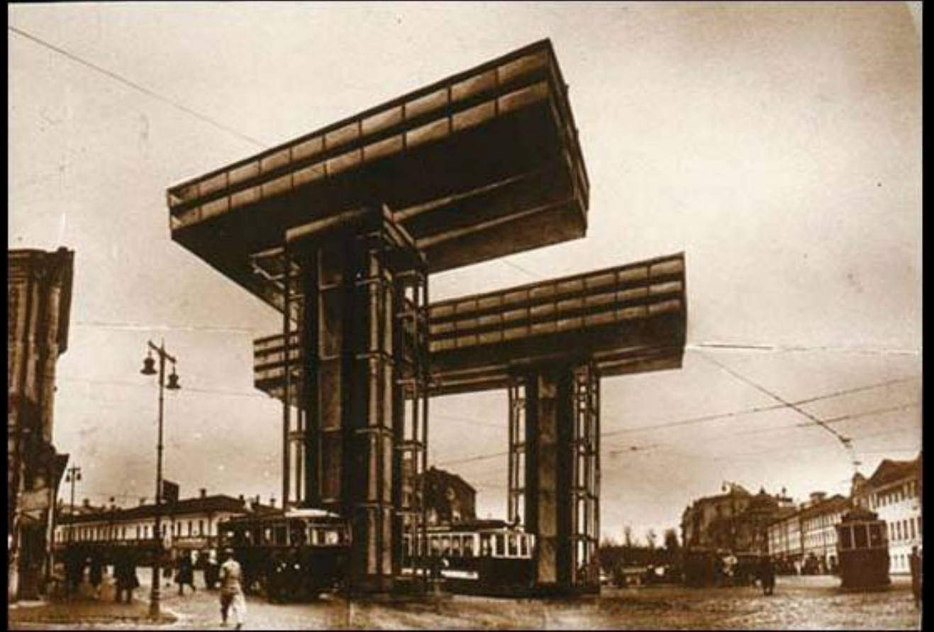
One of the most important priorities in post-revolutionary period was a mass reconstruction of cities.